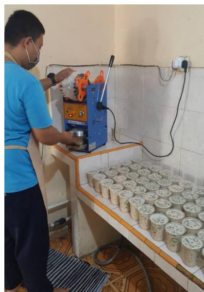
Fig. 1 The process to make Chlorella Jelly Genki in this study.

(8) CV Genki Indah Nusantara, Office, Jl. Pembangunan No. 3, Pekanbaru, Riau.