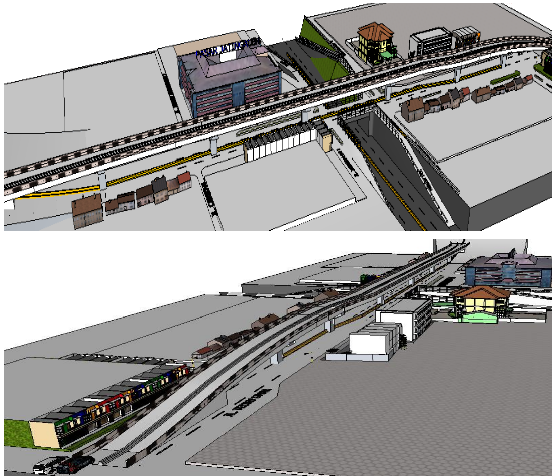
Figure 5.1 The basic design Jatingaleh Fly Over Semarang.