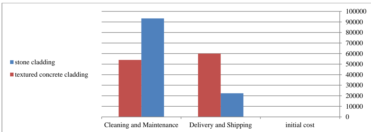
Fig. 2 The variations in costs for the stone and textured concrete cladding [11].

Both stone and concrete have no significant negative impact on the environment since they have the ability to be recycled and manufactured again. However, stone quarries are considered as one of the major sources of pollution threatening the ecosystem. Down et al. [13] mentioned some of the impacts stone quarries have on the environment including: visual intrusion, damage to landscapes, traffic, smoke, noise, dust, damage to caves, loss of land, and a deterioration in water quality. On the other hand, several researches amplified in praising pre-cast concrete as one of the promising sustainable and environmental materials that can replace the in-site cast materials [14].