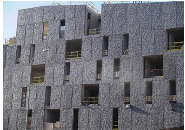
Fig. 4 (Left) stone exterior cladding [15]; (Right) textured concrete exterior cladding [16].