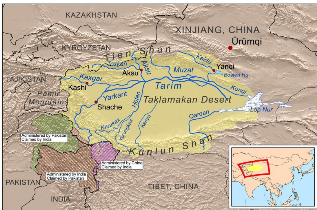
Figure 1. Map of Tarim Basin.