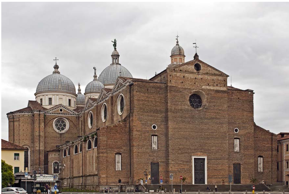
Figure 1. Abbey, Basilica, and Monastery of Saint Justina of Padua, 304-1797, Padua.

In 1177 a devastating earthquake partially destroyed this religious area. Not until the fifteenth century, when the Benedictine Reformers (also known as the Italian Cassinese Congregation) took over the restoration of the old abbey, was a new abbey with a large monastery created and was the cult of Saint Justina expanded, proclaiming her feast day to be on the 7th of October (Figure 1) (Collett, 1985; Zampieri, 2006). 6