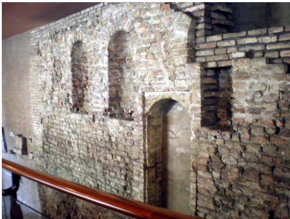
Figure 2b. Church of Saint Justina in Capite Porticus, partial exterior view, 15th century, Ravenna.