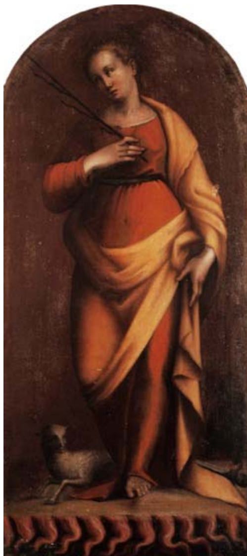
Figure 15. Barbara Longhi, Ravenna Saint Agnes of Rome , 1635, oil on canvas. Canonica della Cattedrale, Ravenna.