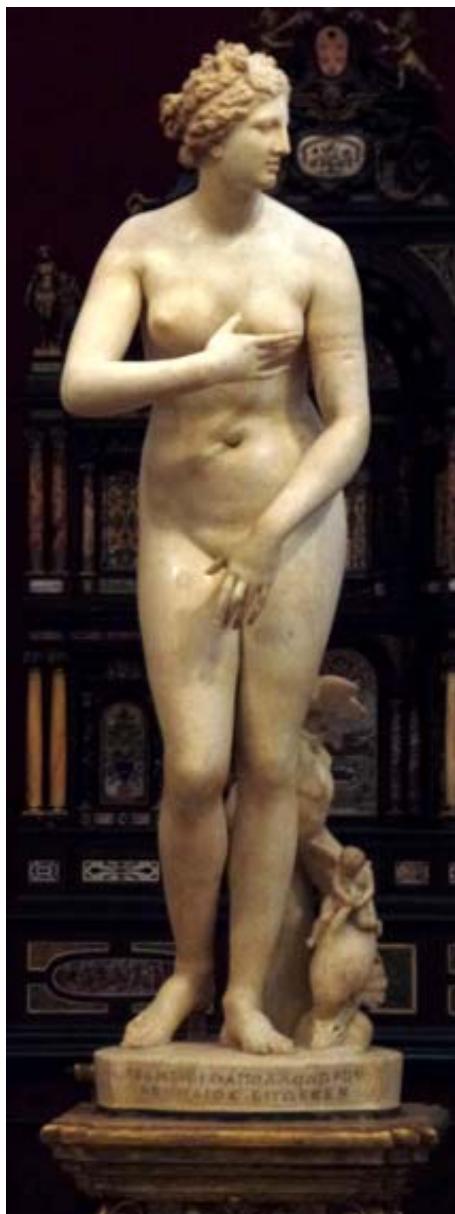
Figure 13. Medici Venus , Hellenistic, late second century BCE, 1.53 m., marble. Tribuna, Galleria degli Uffizi, Florence.

For certain, both Ravennate painters (Barbara and Luca) appropriated images from classical sculptures for the female's hand gestures—for example, classical sculptures or engravings of the type of Venus Pudica (Modest Venus), the ancient Goddess of Beauty and Love, covering her genitals and breasts with her hands, exemplified in the second-century BCE marble Medici Venus (Figure 13) (Havelock, 1995). 14 Undoubtedly, the Longhi artists were also familiar with the newly discovered Roman relief of the Julio-Claudians Augustus and Livia in Ravenna. This original marble fragment was found near the Mausoleum of Galla Placidia (425-450) in the sixteenth century and is now in the National Archeological Museum of Ravenna (Figure 14) (Viroli,