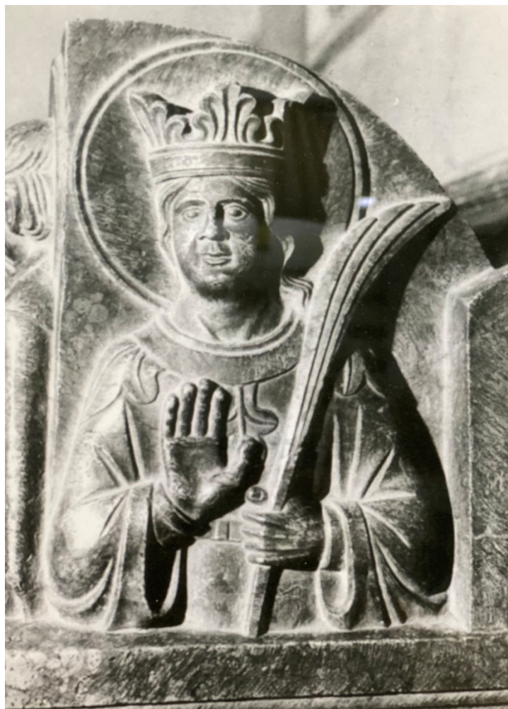
Figure 11. Saint Justina of Padua, 1350, marble, det., from Rogati-Negri Sarcophagus. Basilica of Saint Anthony, Padua.

Curiously, as Luca Longhi took pictorial license that enhances the iconographical meaning and visual experience on seeing this painting, he paralleled the diagonal movement and placement of palm frond next to the sword. Luca continued this pictorial union in using similar tonalities of gold, green, and white in Saint Justina's garments. The green color of the hem at the end of the sleeve matches that of the palm frond and of the sword's handle. The white color around the trimming of the wrist's sleeve balances with the border of the dress's neckline. Cleverly, the artist selected the golden color of the female's hair for the overall tonality of her attire. The coloration is symbolic: the white color referring to innocence and holiness of life, the green color to triumph and rebirth, and the gold or yellow color to the sacredness of the image (Ferguson, 1996, pp. 151-152). Thus in Christian terms, Luca Longhi depicted Saint Justina's purity of soul (white color), faith (green color), and sainthood (gold color), following the decree of the Counter-Reformation to create an image of devotion and meditation (O'Malley, 2012, pp. 28-48; Schroeder, 1978, p. 216; Bosch, 2020, pp. 37-51; O'Malley, 2002).