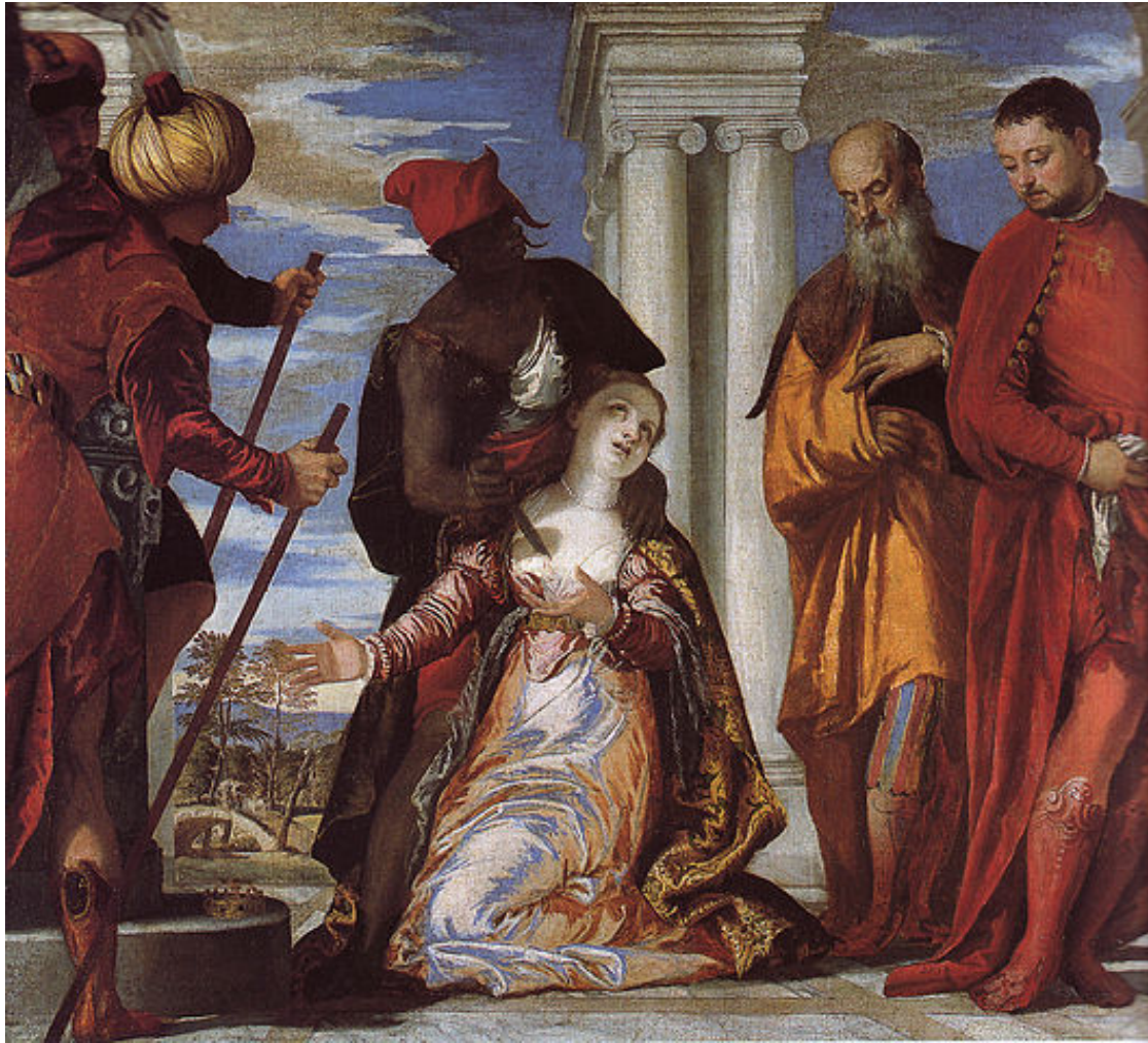
Figure 26. Paolo Veronese, Martyrdom of Saint Justina , 1573, oil on canvas, 103 × 115 cm. Galleria degli Uffizi, Florence.

Saint Justina's popularity as a miraculous saint continued through the centuries, to be evoked in particular in the Venetian states during and after the Christian triumph at the Battle of Lepanto, when the Turks invaded Europe on 7 October 1571. The Christian military and naval victory of the Holy League, a federation of Catholic States under the command of Pope Pius V (Antonio Ghislieri, 1504-1572), destroyed the powerful Ottoman fleet at the Gulf of Patras. In commemoration of this historical event, two visualizations occurred, one in metallic form and the other in oil. The Venetian mint produced new coins called giustine , an "honorary currency provided by the Doge for the nuns of the church in Santa Giustina" (in Venice) to donate to visitors (Fenlon, 1987, p. 222; Niero, 2004, pp. 175-183); and to honor this historical event and miracle, Veronese was commissioned in 1570 to depict Saint Justina's martyrdom for the high altar of the Abbey and Basilica of Saint Justina in Padua 25 (Marini, 1968, p. 116; Salviati, 2012, pp. 11-12). In a tour de force orchestration of colors, diagonal movements, illusionistic space, and human gestures, Saint Justina's martyrdom is received in Heaven by the Holy Trinity and the heavenly court of angels and saints. In the distant foreground, the Basilica is seen,