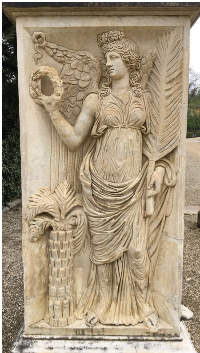
Figure 24. Victory, 240-260 CE, marble, det., Capillatus, Barbarian Prisoner Base. Bacchus Courtyard, Boboli Gardens, Florence.