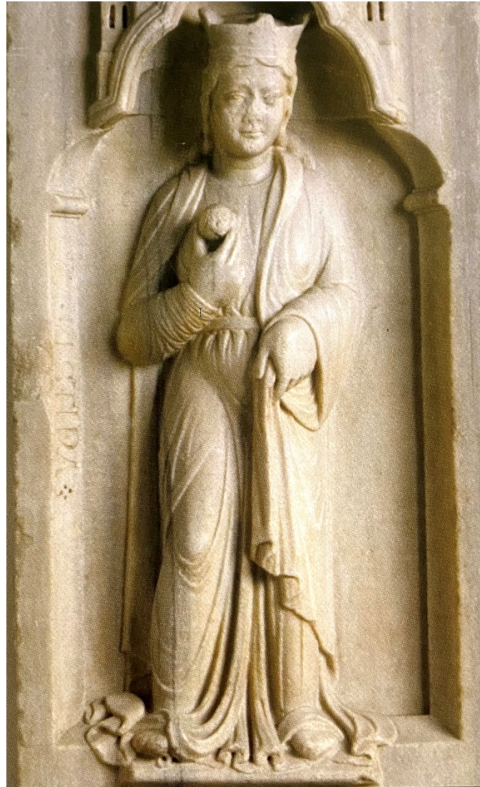
Figure 19. Saint Justina of Padua , 13th century, marble. Romanesque Portal. Basilica of Saint Justina, Padua.

It was probably part of a larger altarpiece, now disassembled and in view at the Metropolitan Museum of Art in New York or was a portrait of a nobil donna in the personification of Saint Justina of Padua. In his Saint Justina of Padua , Montagna depicted a portrait-saint, elegantly attired in the Renaissance courtly tradition, her braided hair with blue satin veil and jewels, pearls, and carnelians or rubies matches her jeweled headdress or headpiece. The pearl necklace with a large red stone pendant emphasizes the motif decoration of strings of pearls following the borders of her dress and perpendicularly emphasizes a very large brooch of similar color on the neckline of the dress. The green velvet sleeves are superimposed on her white chemise sleeves and attached with red jeweled bows. Although Montagna has pictured a courtly portrait recalling Justina's royal birth, he also has added to the image elements emphasizing her holiness, such as a suspended and large golden halo contrasting with the silver string crown on her head. In addition, the figure holds vertically with her right hand a palm frond, the same green color of her sleeve. A closer inspection of the left sleeve reveals a foreshortened sword plunged into the saint's breast, the instrument of her martyrdom. Montagna composed another bust-length painting of Saint Justina of Padua as portrait-saint (1500, now at the Museo Correr in