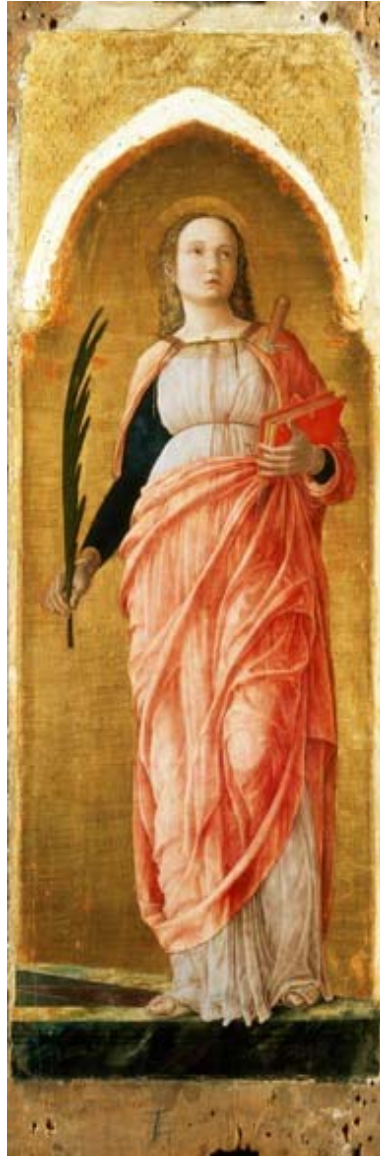
Figure 16. Andrea Mantegna, Saint Justina of Padua , 1453, tempera on panel, det., Saint Luke Altarpiece. Pinacoteca di Brera, Milan.

Michelangelo's David (1501-1504, now in the Galleria dell'Accademia in Florence). 17 Veronese also assimilated Jacopo Sansovino's inventive compositions of standing figures, done between 1538 and 1541, inside the niches of the base in the Loggetta located under the bell tower in Saint Mark's Square in Venice (Bury, 1980; Morresi, 2000). 18