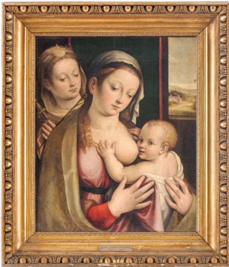
Figure 5. Barbara Longhi, Madonna and Child with Saint Justina , c. 1600, oil on canvas, 55 × 4 cm. Private Collection.