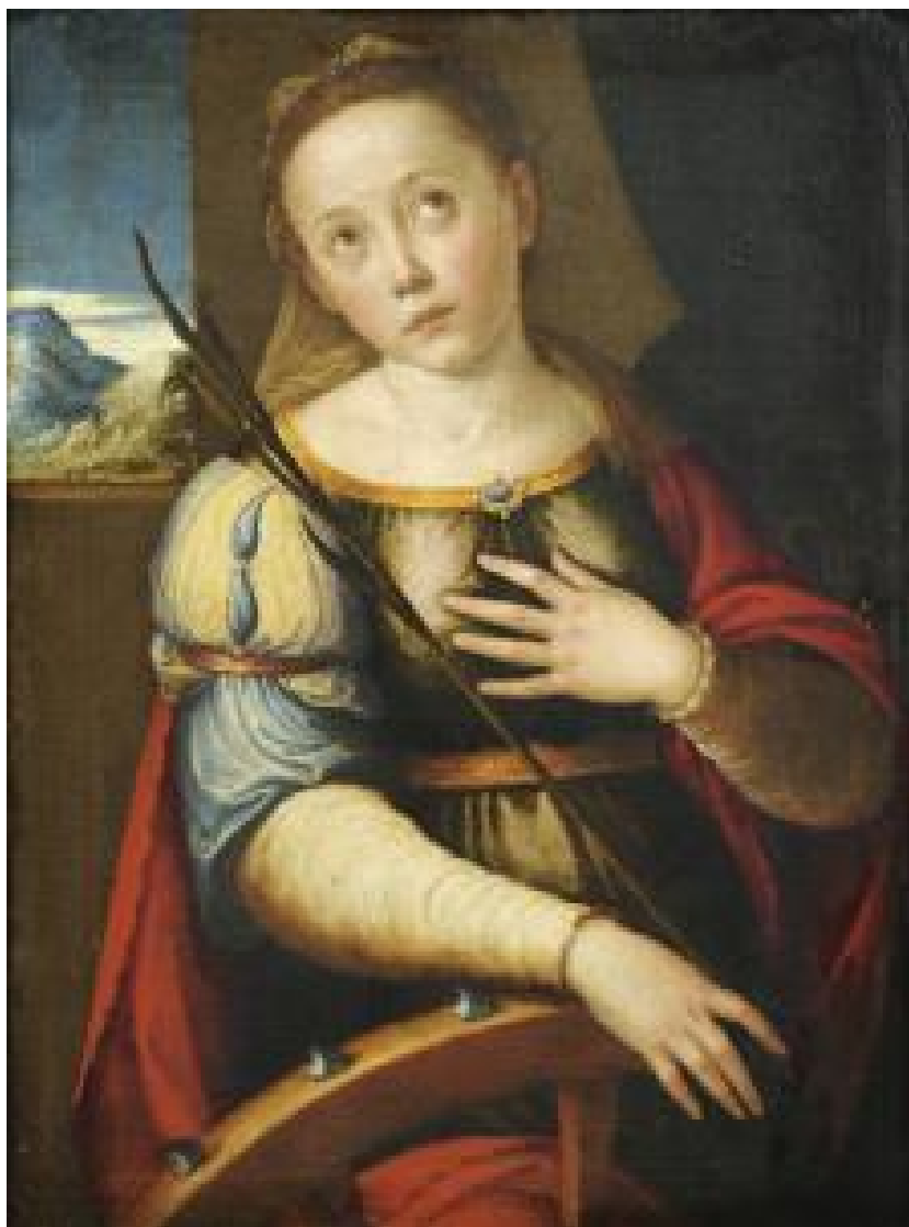
Figure 12. Luca Longhi, Saint Catherine of Alexandria , 1575-1580, oil on canvas, 64 × 47 cm.