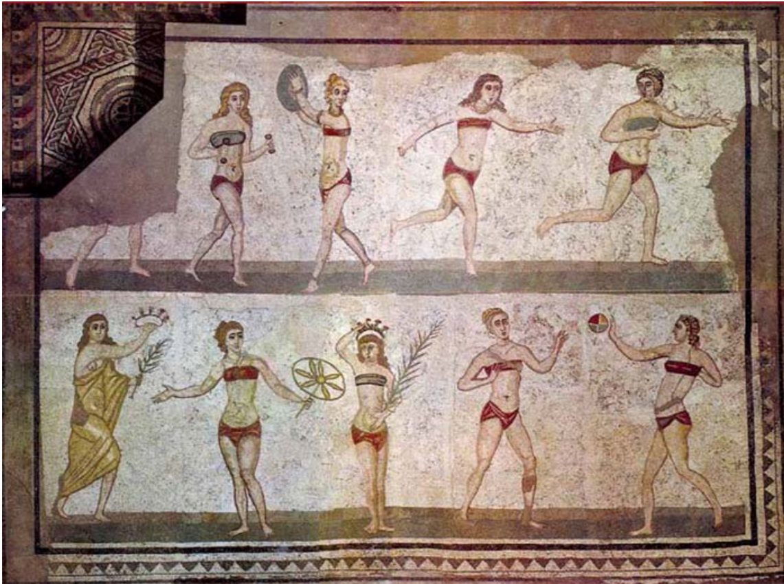
Figure 25a. Women's Athletic Contests, fourth century CE, mosaic. Villa Romana del Casale, Piazza Armerina, Sicily.