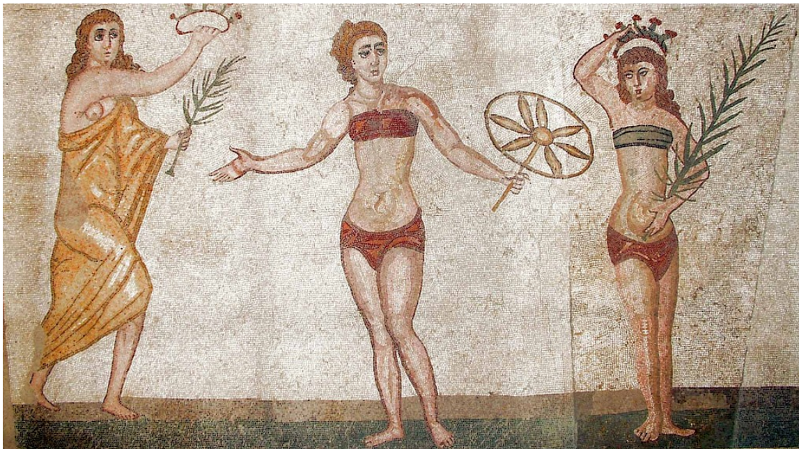
Figure 25b. Women's Athletic Contests, fourth century CE, mosaic, det. Villa Romana del Casale, Piazza Armerina, Sicily.