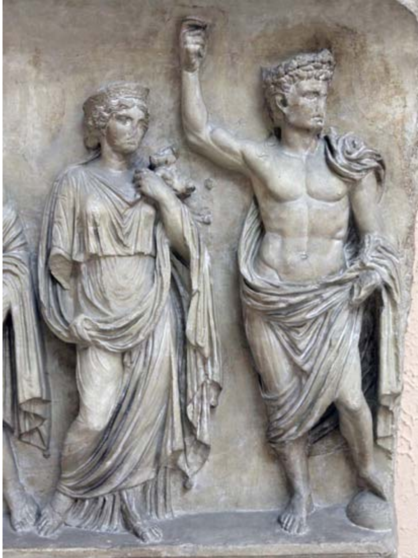
Figure 14. Livia and Augustus, 37-41 CE, marble, det., Julio Claudian Relief. National Archeological Museum, Ravenna.