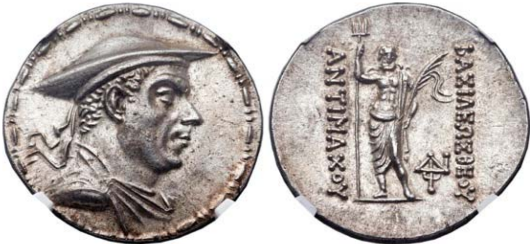
Figure 23a. Medal of Antimachus I Theos, King of Bactria, 2nd century BCE, silver. Recto: Portrait; Verso: Poseidon draped in a himation and holding a trident and a palm frond.