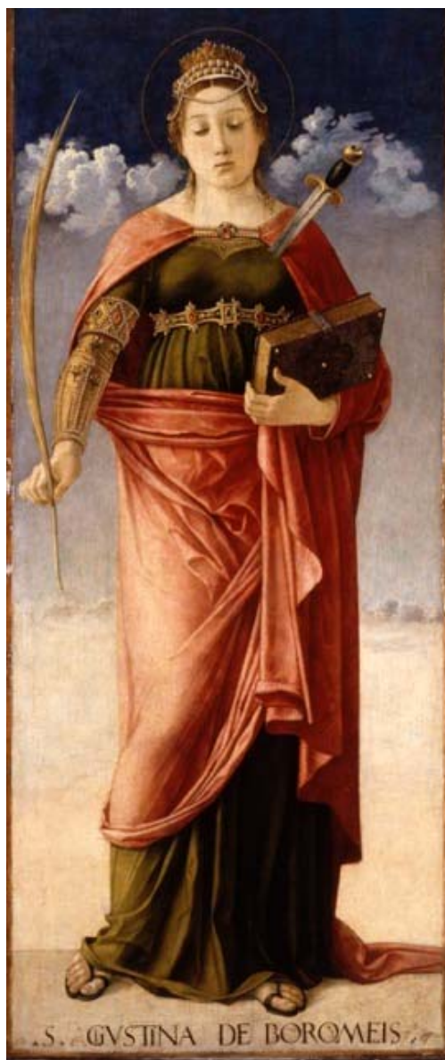
Figure 17. Giovanni Bellini, Saint Justina of Padua , 1470, tempera on panel. Palazzo Bagatti Valsecchi, Milan.