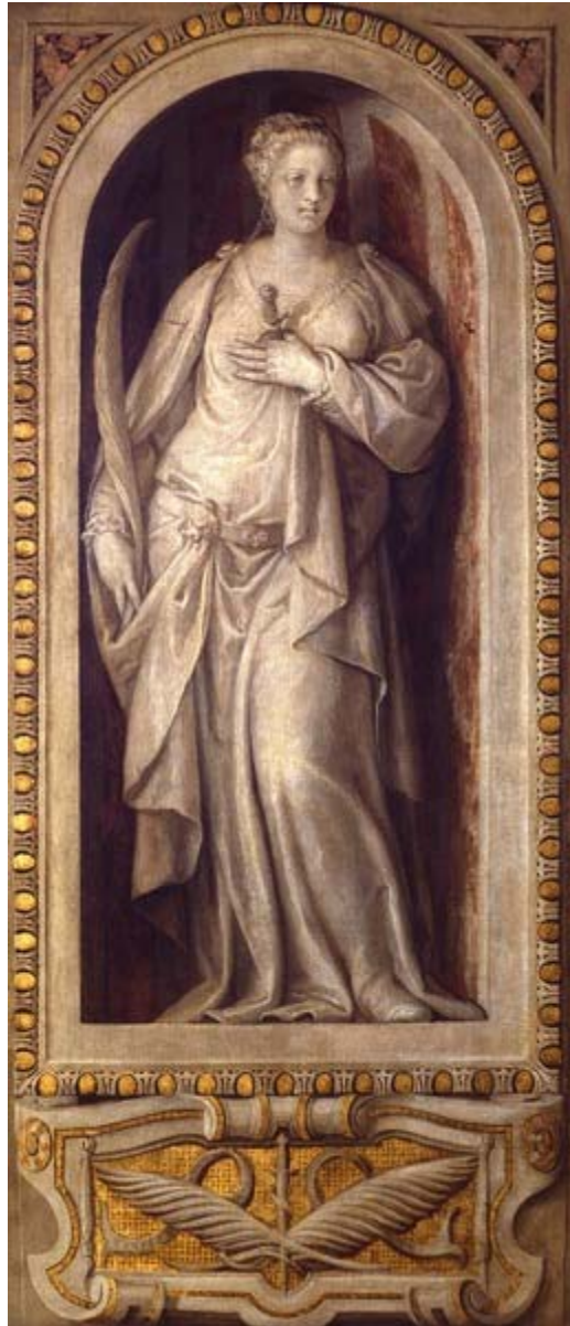
Figure 18. Paolo Veronese, Saint Justina of Padua , 1582, oil. Sala del Colleggio, Ducal Palace, Venice.

Inspired by Mantegna's composition, Giovanni Bellini painted a mysterious Saint Justina of Padua (Figure 17), which was commissioned by the Borromeo family and now is in the Palazzo Bagatti Valsecchi in Milan. In a parapet, the holy figure stands in contrapposto, dressed in Renaissance courtly attire, and crowned as a majestic saint. She holds her ascribed attributes of martyrdom—a palm frond and a book—while her breast area is pierced with a gladius . Her royal status is revealed with the ornamentation of jewels: a golden jeweled belt with pearls and carnelian stones matching the jewel decorations in her sleeve and arm band, and a long pearl brooch holding her mantle. A halo surrounds her royal crown that rests on a double row of tresses braided with lace and pearls. Bellini has created a combination of a mystical and physical space behind the standing holy figure. Using a sfumato technique and visually moving from the bottom to the top of the picture plane, the coloration in this background modulates gradually from a creamy lightness into a bluish tonality, a