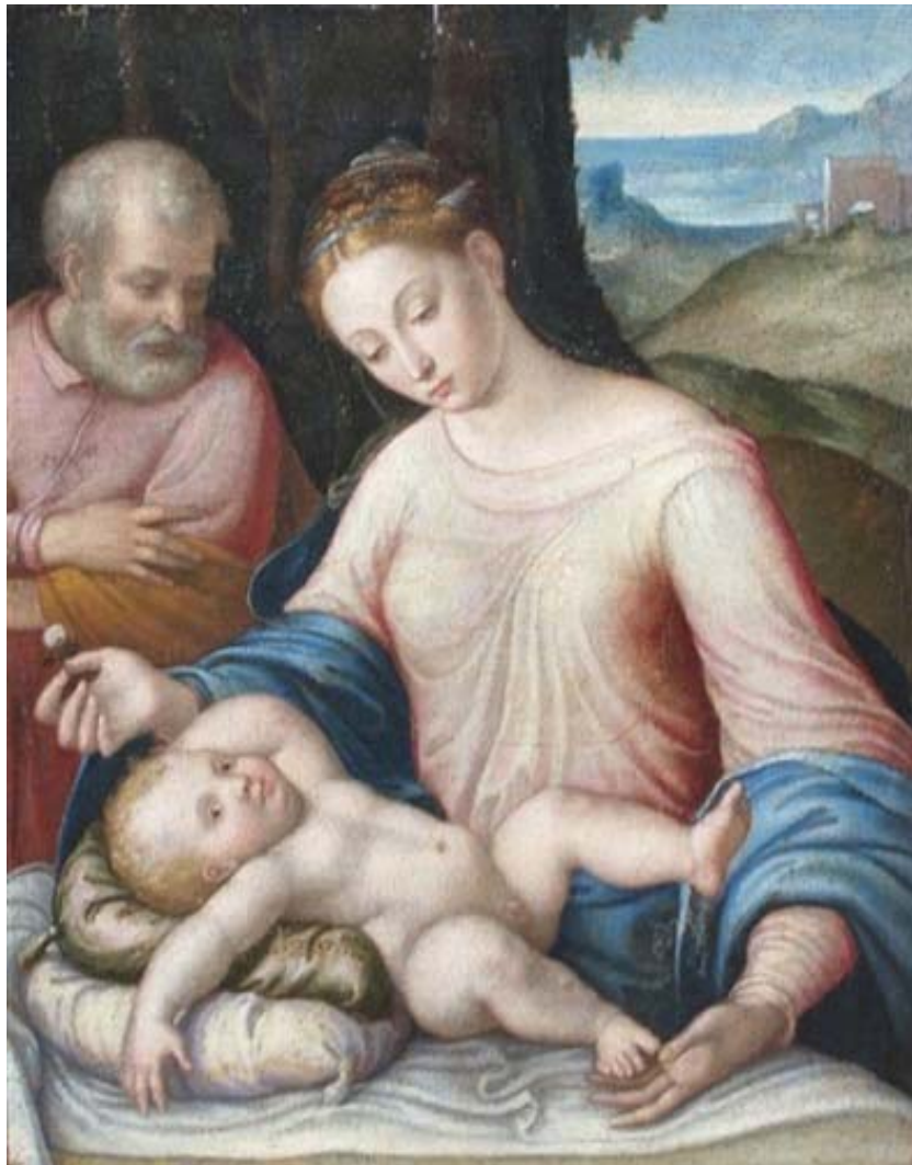
Figure 7. Barbara Longhi, Ohio Holy Family , 1589-1590, oil on canvas, 37.5 × 30.3 cm. Previously in Dayton Art Institute, Ohio. Now Private Collection.

the holy figures, Barbara created a suspended spiritual moment, revealed by the figures' intimate expressions of gentle hand-touching and loving gaze.