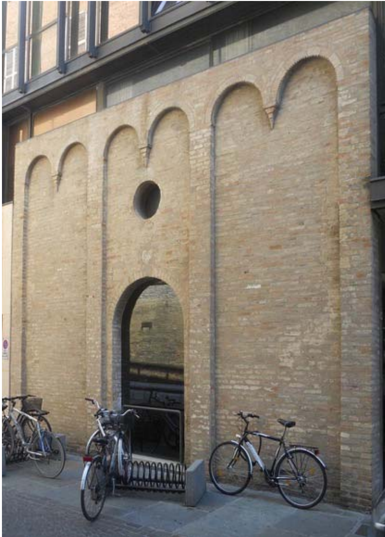
Figure 2a. Church of Saint Justina in Capite Porticus, remains of interior, 13th century, Ravenna.