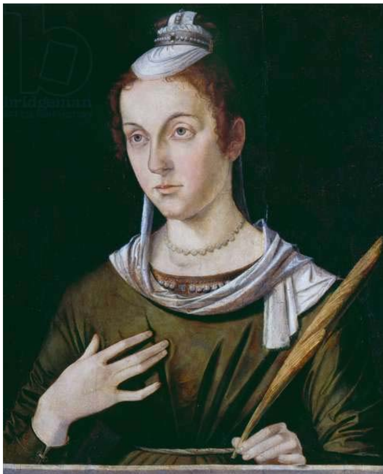
Figure 22. Bartolomeo Montagna, Saint Justina of Padua , 1500, oil on panel, 24 × 28.4 cm. Museo Correr, Venice.

Ancient numismatic imagery provided earlier depictions of the palm frond as held by pagan gods as a symbol of divinity and victory. For example, on the medal's reverse of Antimachus I Theos (185-170 BCE), King of Bactria, dated in the second century BCE, the incised image shows Poseidon, God of the Sea, standing in contrapposto, draped with a himation, and holding a trident and a palm frond (Figure 23a). 21 This pagan motif for imperial political victory was appropriated in Christian times and used in propagandistic medals by the converted Roman Emperor Constantine I. He aggrandized his image as a divine and Christian ruler through the dissemination of coins, portraying on the recto of the medal his portrait, and on the verso, a device of a female figure personifying victory that holds a palm frond as a symbol of triumph (Figure 23b). 22