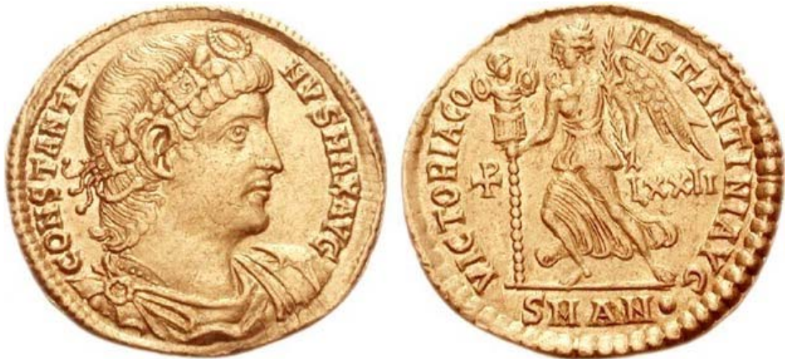
Figure 23b. Medal of Emperor Constantine I, 335 CE, gold.