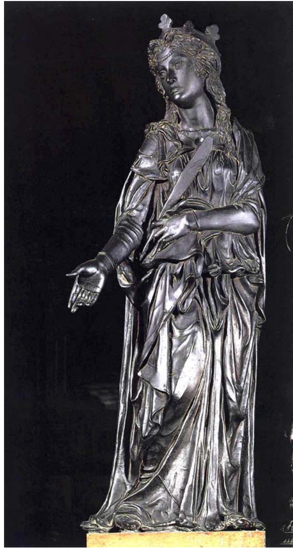
Figure 20. Donatello, Saint Justina , 1447-1450, bronze, 153 cm. High Altar, Basilica of Saint Anthony, Padua.

Venice, Figure 22). This unusual version depicts the figure of the saint with a languid expression. She is painted with muted colors, showing a simple courtly dress and few jewels. At an imagined open window, the figure frontally faces the viewer, resting one hand with a palm frond on a windowsill. In full view, the other hand with long tapering fingers points to the wound in her chest, reminding the observer of her martyrdom. Montagna's young females look pensive and detached from their surroundings. Their dominant spiritual state is suspended in time, contrasting with the actual delightful decor of their attire, yet Montagna captured, as did Barbara Longhi, the physical beauty and spiritual courage of the saint.