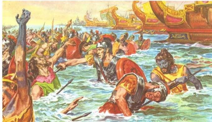
Figure 2. Darling, D. Caesar in Britain 2 .

Caesar's second expedition started the following year, on July 6, 54 BC. This time, he brought five legions and 2,000 cavalries. Fighting through Southern Britain, he crossed the river Thames and forced the British leader Cassivellaunus into surrender. Caesar then imposed peace treaties on the Britons before finally returning to Gaul on September 3, 54 BC (Figure 3 & Figure 4).