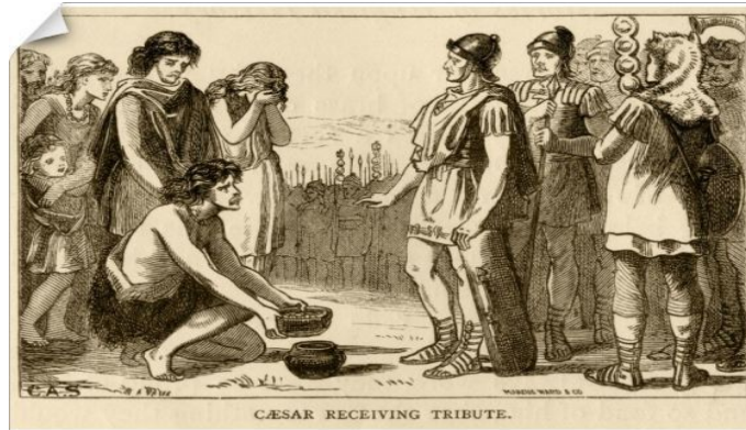
Figure 4. Julius Caesar receiving tribute. Marcus Ward & Co, London & Belfast 4 .