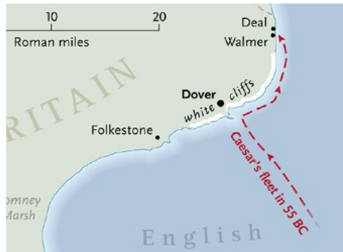
Figure 1. Caesar's fleet across the channel during his first invasion in 55 BC 1 .