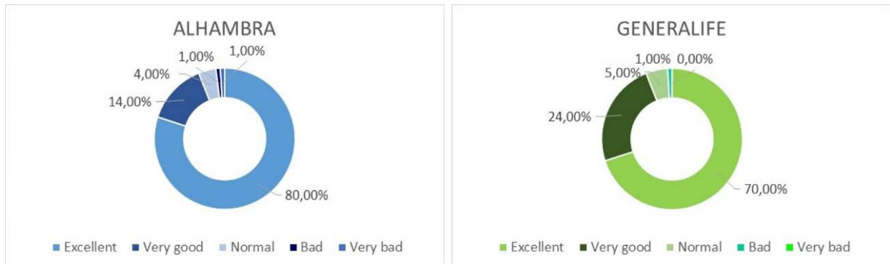
Figure 2. Relative distribution of opinions on the Alhambra and Generalife on TripAdvisor, June 2012 (Source: Own elaboration based on data provided by TripAdvisor).

Figures 2 and 3 show the relative distribution for the Alhambra and the Generalife collected on TripAdvisor in the two periods (June 2012 and May 2014).