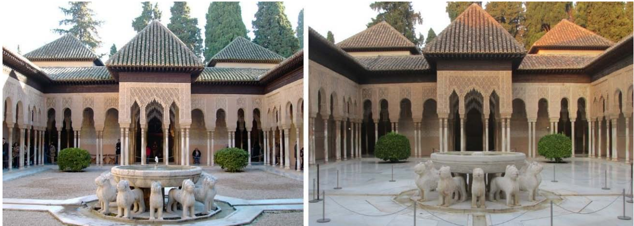
Figure 1. General views of the previous and current state after the intervention image before and after the restorative intervention performed in the Patio de los Leones (Source: Images of the authors).

Alhambra is universally recognized for the Courtyard of the Lions and more specifically for its Fountain, being a key and essential icon when visiting the monumental complex (Yusty Pérez, Fernández Rodríguez, Prados, & Caro Rodríguez, 2017). The restoration of the fountain and Courtyard of the Lions was accompanied by a complex communication process, characterized by its continuity over time (it started in 2002 and ended in 2012). Different broadcast media (mass media, Internet and social media and specialized media) were also used (Yusty Pérez et al., 2017).