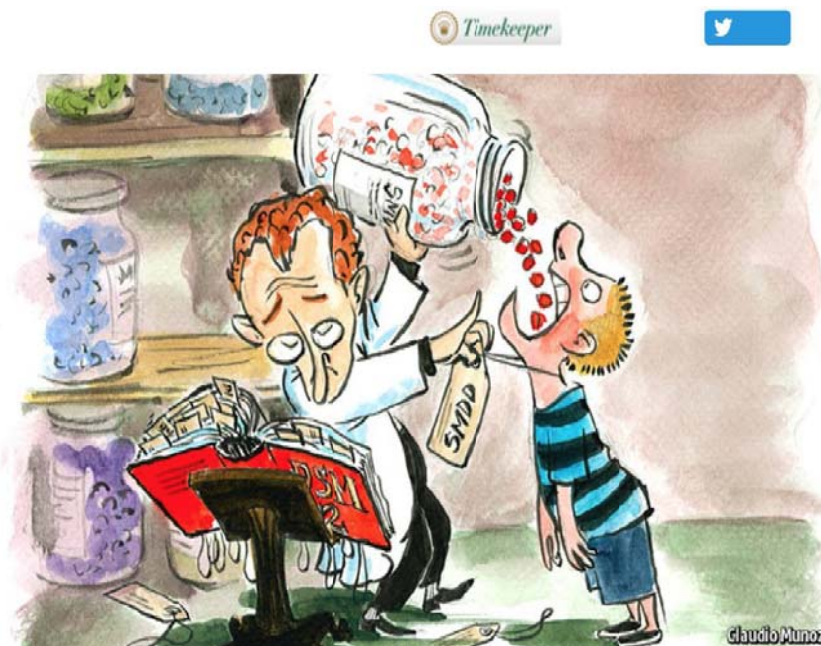
Fig. 1 The Economist May 18th 2013.

DSM-5 By the book May 18th 2013 | NEW YORK | From the print edition The Economist . The American Psychiatric Association's latest diagnostic manual remains a flawed attempt to categorise mental illness.