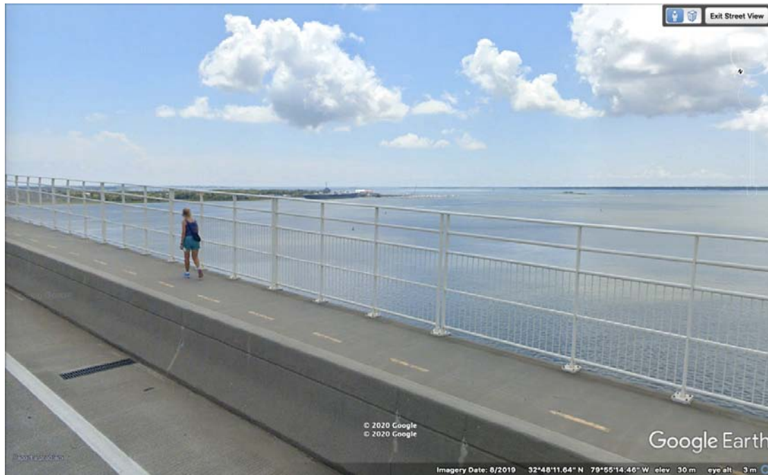
Figure 4. An anonymous young woman walking her personal bridge to tomorrow. Her eyes are on the walk way, not the magnificent vista of the bay, or the museum aircraft carrier in the distance. Inwardly, she is ordering her noumenal cosmos, her left brain refuge of Saint Teresa’s interior castle. Google Earth street level image.

Private Ego lives in the left brain fully occupied with its own ideas & plans, although being kept well-informed about reality through the corpus callosum. By exercising Kant’s oneness function, we synthesize & organize sense data, a panoply of records from our interconnected individual & tribal experiences.