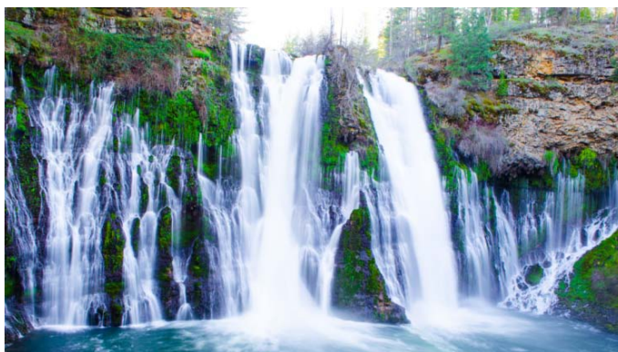
Figure 1. Burney Falls, Modoc Plateau, Shasta County, California.

Keywords: Kant's inner & outer senses, orderly inner self & chaotic outer environment, brain laterality, interior cosmos, metaphysical gap