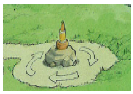
Figure 7. "Hard Brexit" is dead end.