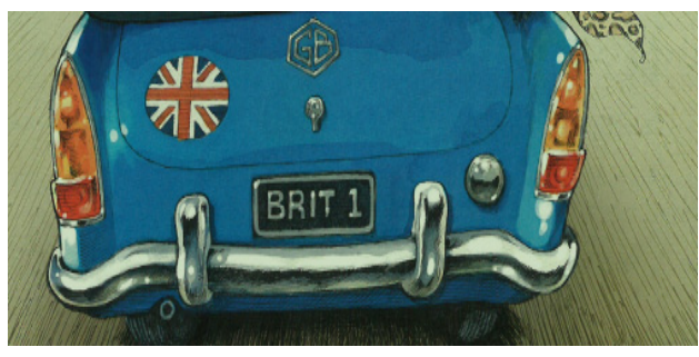
Figure 3. Britain is "Car".

The car with a Britain national flag is in the process of driving. Since the driver is Theresa, and taking the national flag into consideration, the car might be mapped to Great Britain, just like the abbreviation "GB" printed on the car. The central element, the national flag, is standing for the whole nation. As depicted in the figure, the car is in good condition, but the journey waiting for the car is full of barriers. The car itself cannot choose its direction, and it is the driver who decides which road to take. Making unsuitable and unsafe decisions when driving would lead to serious accidents. Therefore, even though residents wish to remain in the EU, and for those who agree to leave, majority would prefer soft Brexit, the future of Britain is still held by the leaders.