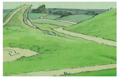
Figure 9. "Soft Brexit" is safe.

In contrast with the dangerous road conditions such as cliff, twists, broken bridge, the journey in another direction is much more comfortable. If the driver turns right, she would face a road without hindrance. Thus, the figure contains a strong signal that a soft sort of Brexit should be selected. A successful journey is a successful political event. That is to say, Britain should not cut off the connection with the EU in such a complete way, which would bring damages to the nation.