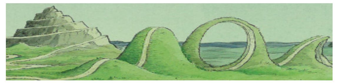
Figure 8. "Hard Brexit" is dangerous.

Theresa intends to choose a harder sort of Brexit, but the cartoon depicts a dangerous journey for this direction. From the Figure 4, the warning sign on the edge of a cliff is eye-catching. The triangular sign is used to inform the drivers or pedestrians that the road ahead is full of dangers so that they should be highly careful about the road condition. This warning sign represents a real warning in the process of hard Brexit, but Theresa, as the driver in the figure, is not aware of the warning and she overestimates the current situation.