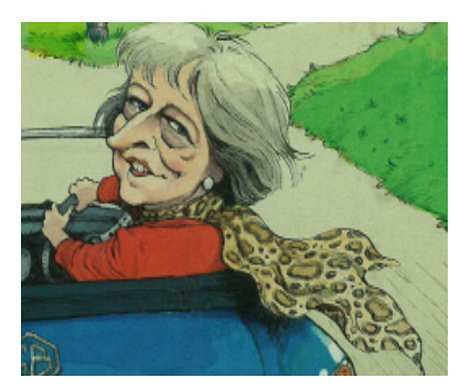
Figure 2. Theresa is "Driver".

As we can see from the figure, the female driver wearing a leopard-patterned scarf in the picture can be recognized as Theresa May, who is the 76th Prime Minister of the United Kingdom, for she is famous for her fancy