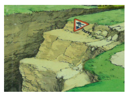
Figure 4. "Hard Brexit" is the edge of cliff.