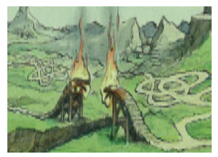
Figure 5. "Hard Brexit" is the broken bridge on fire.