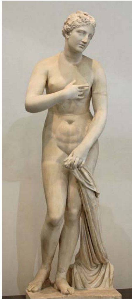
Figure 12. Menophantos, Venus pudica , first century BCE.

the Birth of Venus and the Primavera —Venus and Flora, respectively. He studied these Roman sculptures for their stance, movement, and gestures, as well as for the treatment of the human body, proportion, classical facial features, and rendition of drapery. For example, in the statue of Minerva, her himation or mantle is treated as a “wet drapery motif” designed to reveal and conceal, at once, her body. Her cuirass, helmet, and shield are the attributes of the virgin goddess (see Figure 14) (Warburg, 2003, pp. 15-17). 6