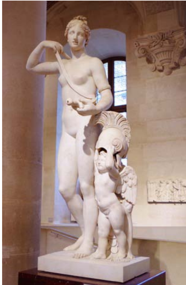
Figure 15. Venus victrix, second century CE. Roman copy restored in the sixteenth century. Musée du Louvre, Paris.

In Minerva and the Centaur , Botticelli portrayed Minerva as disarming the Centaur and controlling him with her hand gesture of clenching on his hair, yet with a look of forgiveness; after all she is dressed as an honorific and peaceful guardian and not a combative soldier. Botticelli incorporated this conceit of a female deity (Minerva or Venus) disarming a lover or an opponent in another mythological painting, Mars and Venus of 1490, now at the National Gallery in London.