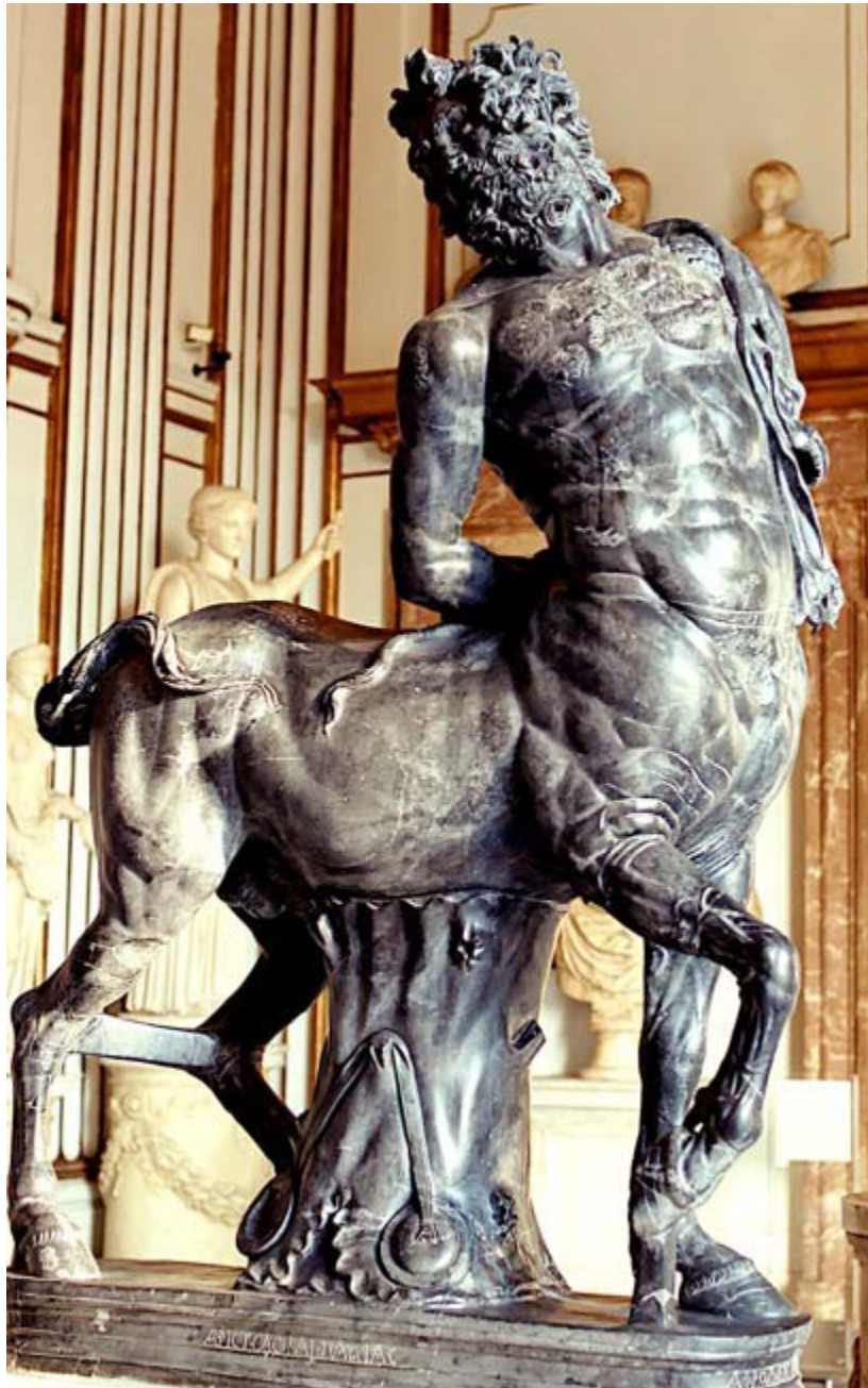
Figure 8. Old Centaur , second century CE.

Grey-black marble, Roman copy after Hellenistic original.