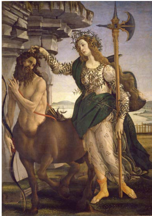
Figure 1. Botticelli, Minerva and the Centaur , 1482-1483.