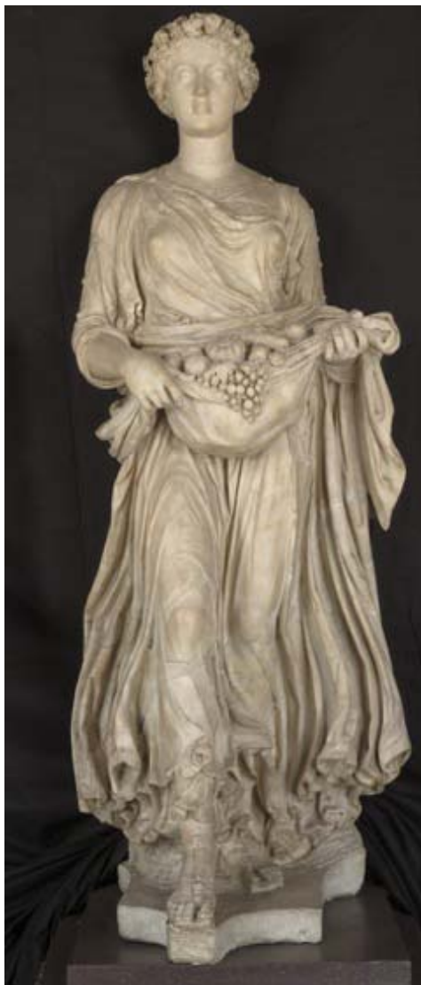
Figure 6. Pomona (Flora or Hora), first century, CE. Roman copy.