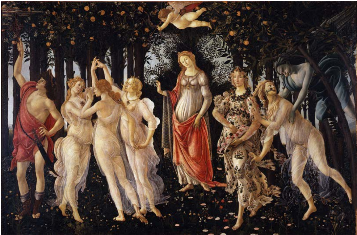
Figure 2. Botticelli, Primavera , 1480.