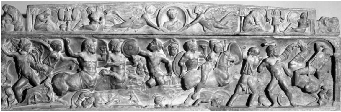
Figure 5. The Battle of Bacchus, Centaurs and Amazons, 160 CE.

Roman sarcophagus. Museo Diocesano, Cortona, Italy.