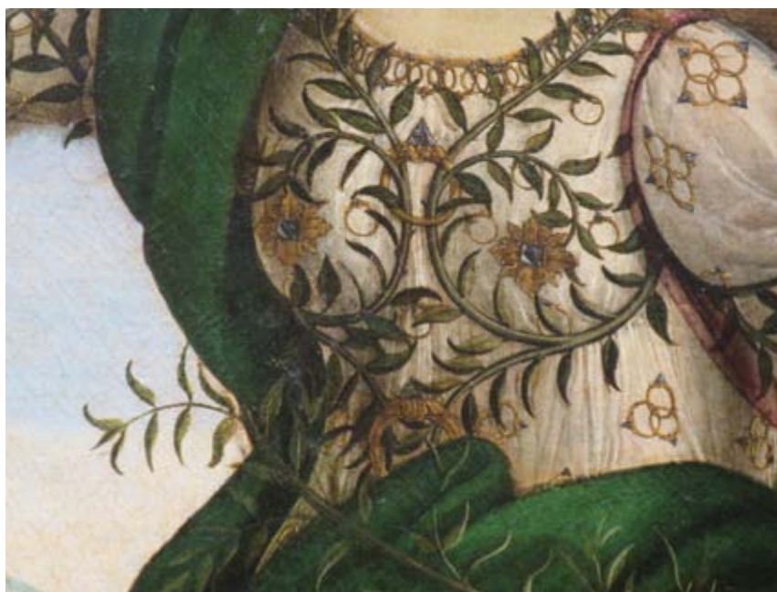
Figure 1e. Botticelli, Breastplate, det. Minerva and the Centaur, 1482-1483. Galleria degli Uffizi, Florence.

The Medici's impresa is a conceit of the diamond motif, which is composed of a design of three intertwined diamond rings with the motto "Semper" (Forever). The earliest conception of the Medicean impresa of the diamond was initiated by Cosimo II Vecchio de' Medici, Lorenzo de' Medici's grandfather, with his insignia of three diamond rings symbolizing the connection of the Medici with France and Spain. His son,