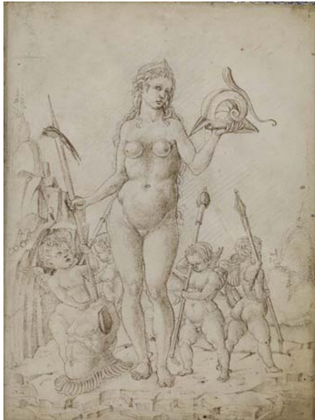
Figure 16. Marco Zoppo, Venus victrix , 1470, drawing.