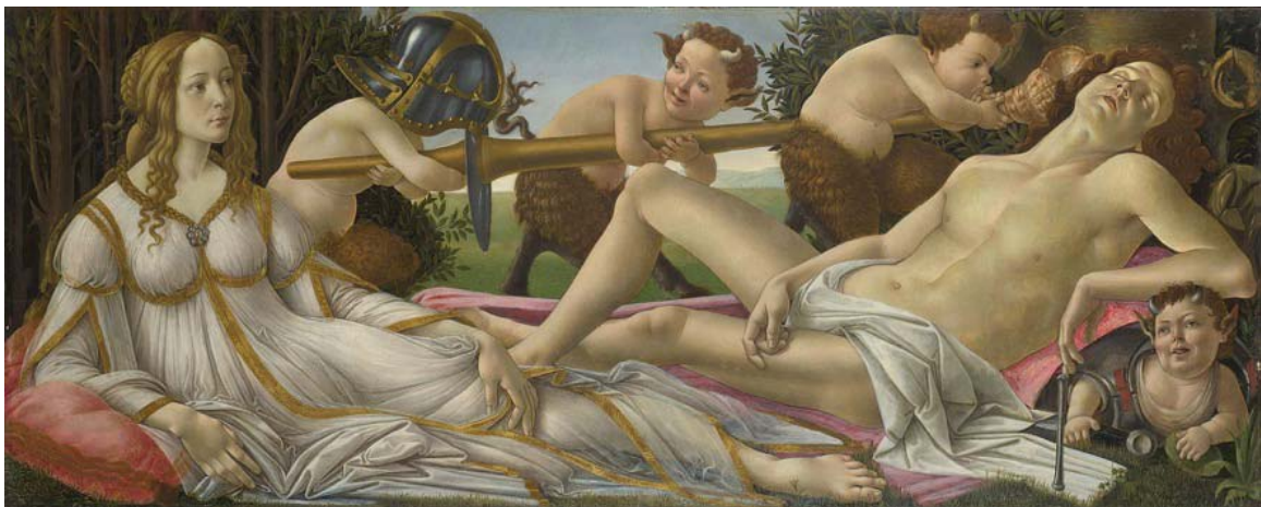
Figure 4. Botticelli, Mars and Venus , 1485-1490.