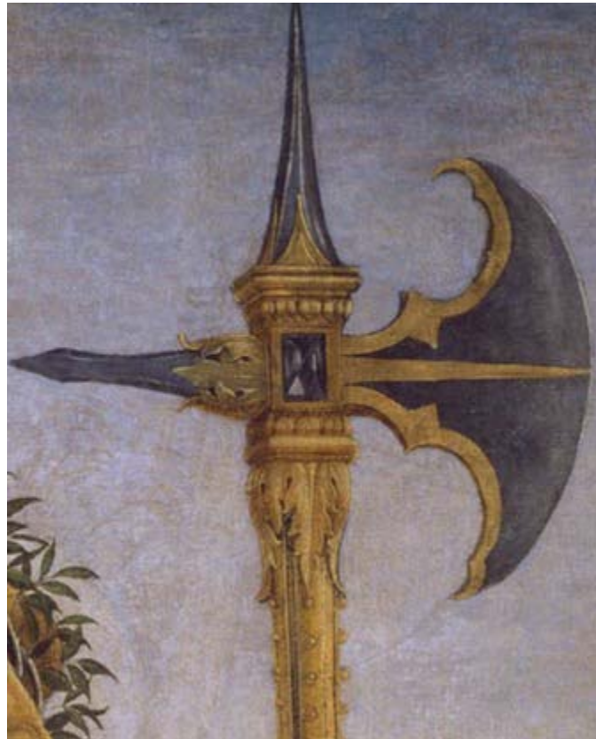
Figure 1b. Botticelli, Spear, det. Minerva and the Centaur , 1482-1483.