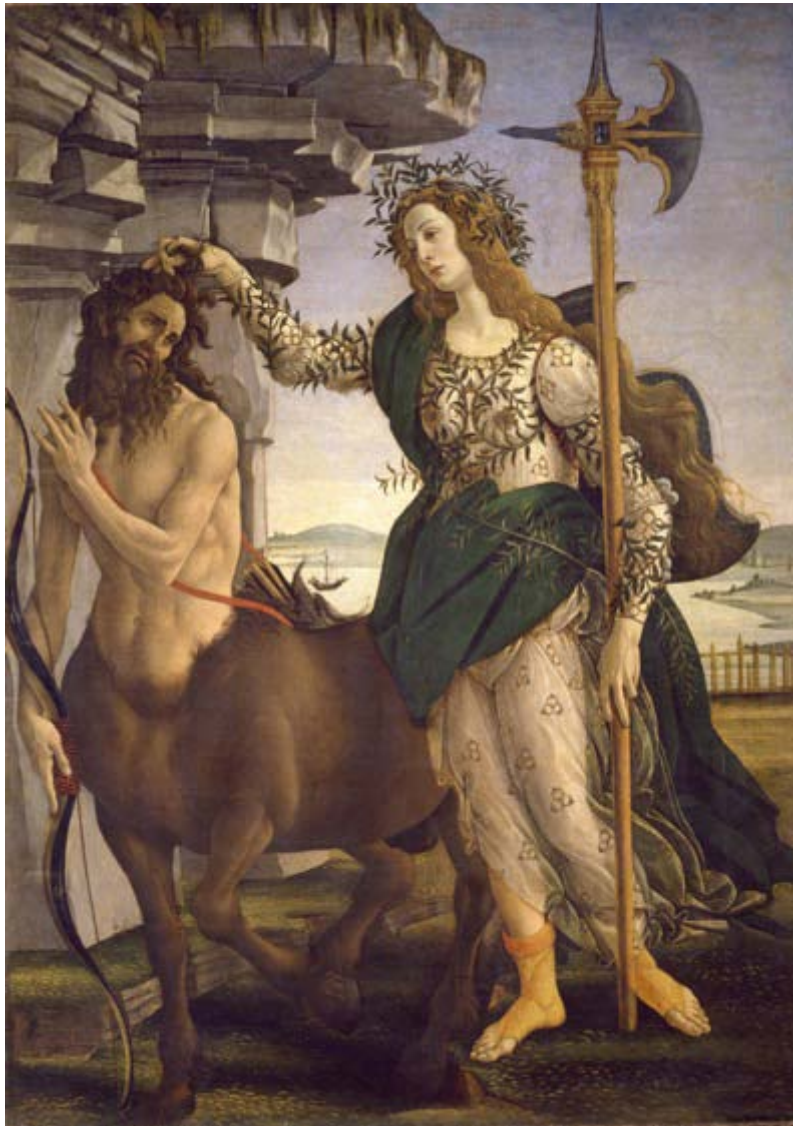
Figure 1. Botticelli, Minerva and the Centaur , 1482-1483.