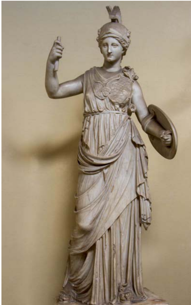
Figure 13. Roman Minerva (Athena), first century CE, Roman.

Copy of a third century BCE Hellenistic original.