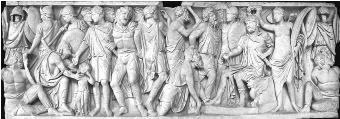
Figure 11. Roman Military Triumph or Trajan's Triumph , second century CE.

Roman sarcophagus. Museo Pio Clementino, Vatican.