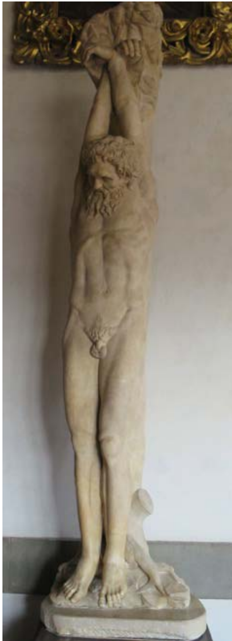
Figure 7. The Flaying of Marsyas, first or second century CE. Roman copy of Greek second or third century BCE. Galleria degli Uffizi, Florence.