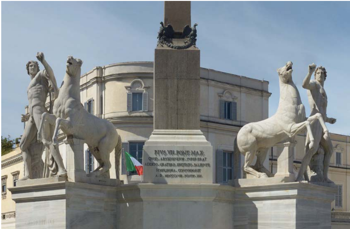
Figure 10. Dioscuri of Monte Cavallo , 315 CE, Roman copies.