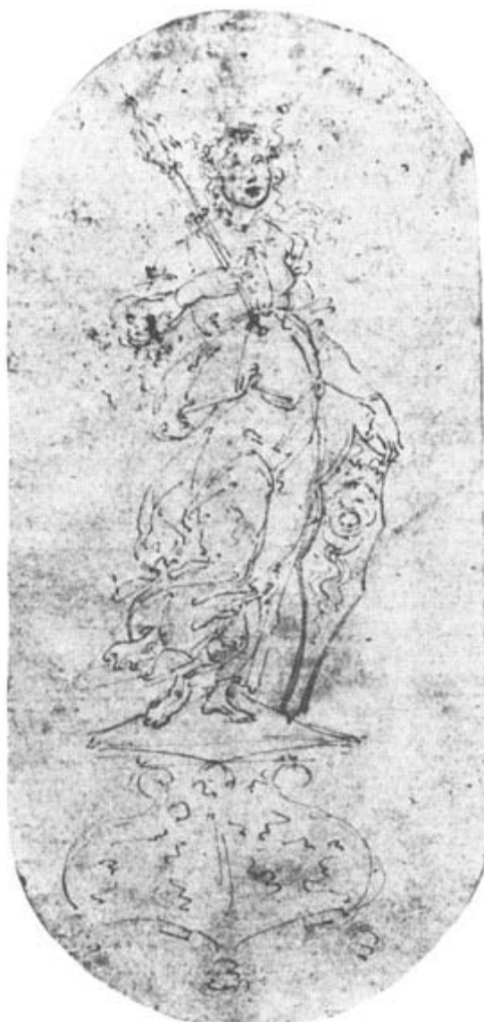
Figure 17. Botticelli, Minerva (Pallas) , 1480s, drawing. Ambrosiana Library and Museum, Milan.

1491 (now in a French private collection) can be considered as studies for a Minerva pacifica (Lightbown, 1978; Wittkower, 1987; Schumacher, 2010). 23