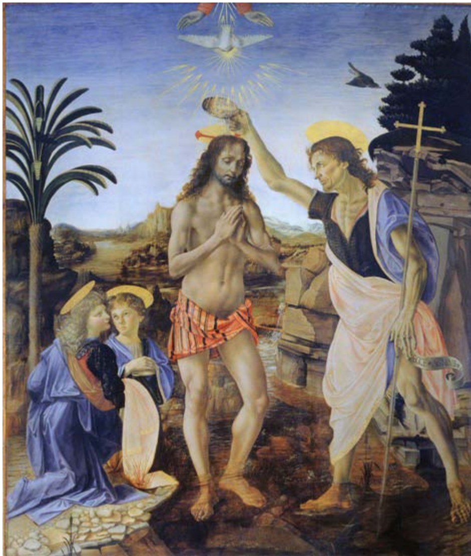
Figure 19. Andrea Verrocchio, Baptism of Christ , 1472.