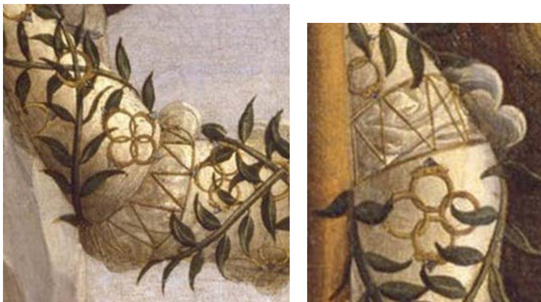
Figures 1c-1d. Botticelli, Arm bands, dets. Minerva and the Centaur, 1482-1483. Galleria degli Uffizi, Florence.