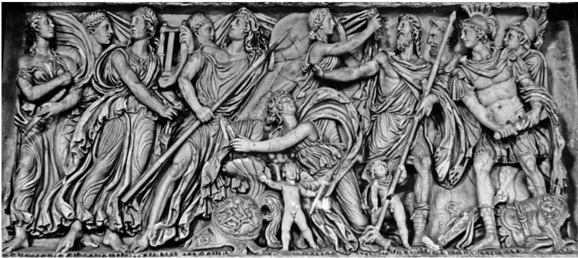
Figure 14. Roman sarcophagus relief of Achilles on Scyros , 250-260 CE.