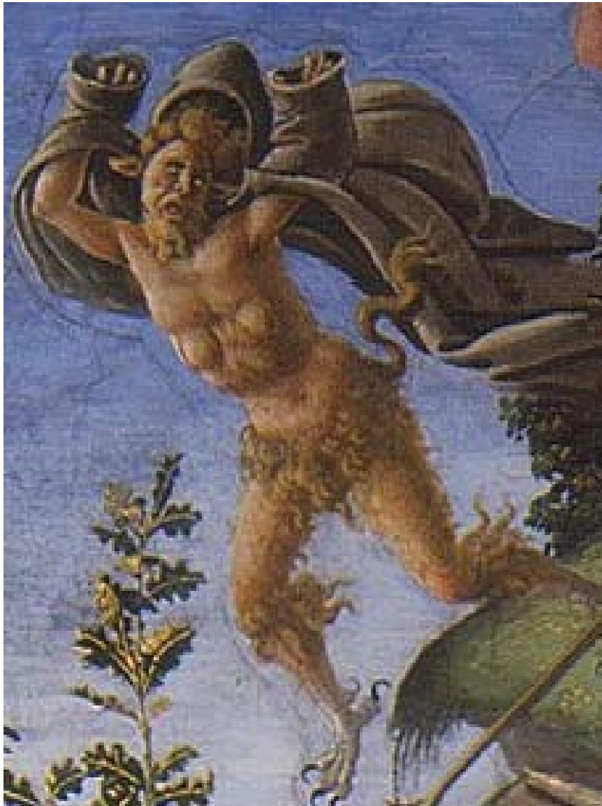
Figure 9. Botticelli, The Devil, det. Temptation of Christ , 1481-1482.