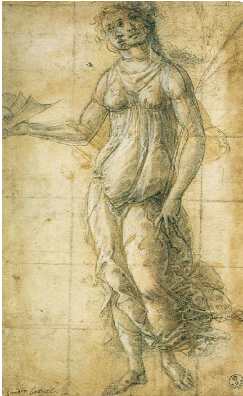
Figure 18. Botticelli, Pallas , 1480s, drawing. Gabinetto dei Disegni e delle Stampe. Galleria degli Uffizi, Florence.