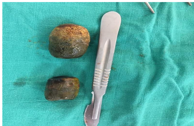
Fig.5 calculi divided into two parts enclosed in the jejunum.

over 65 years old [5]. This phenomenon is especially visible in women between 70 and 80 years old.