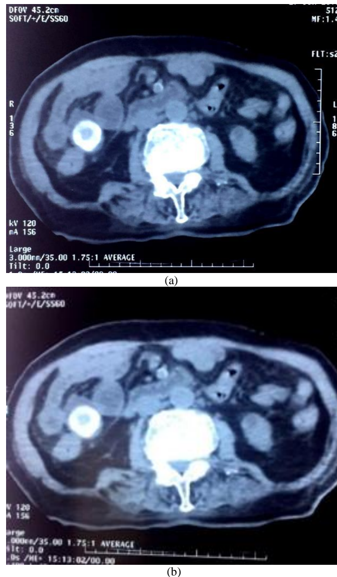
Fig. 3 (a) Aerobilia (pneumobilia) and (b) jejunal calculus (stone in the jejunum).

median incision on the umbilicus revealed the distention of the second pelvic loop, confirmed the presence of the cholecystojejunal fistula, and revealed the presence of two obstructive calculi (3 cm wide) at the level of the intestinal lumen without perforation of the small bowel (Fig. 4a).