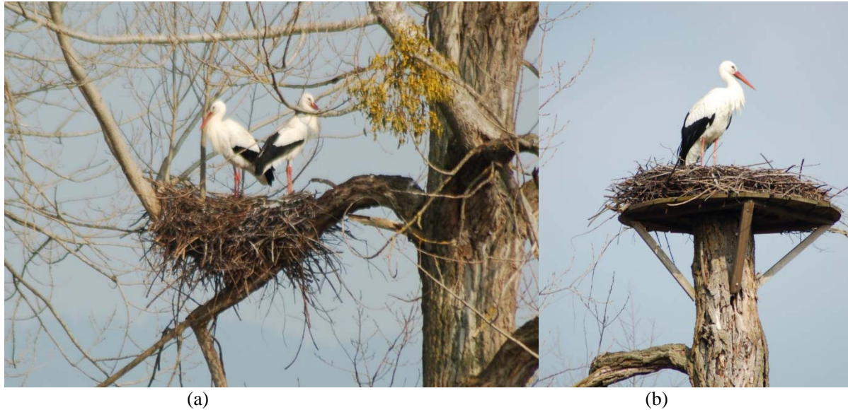
Fig. 4 Because nests (a) are often destroyed by storms, the birds were provided with artificial platforms, on pylons or tree stubs (b), in order to facilitate reintroduction.