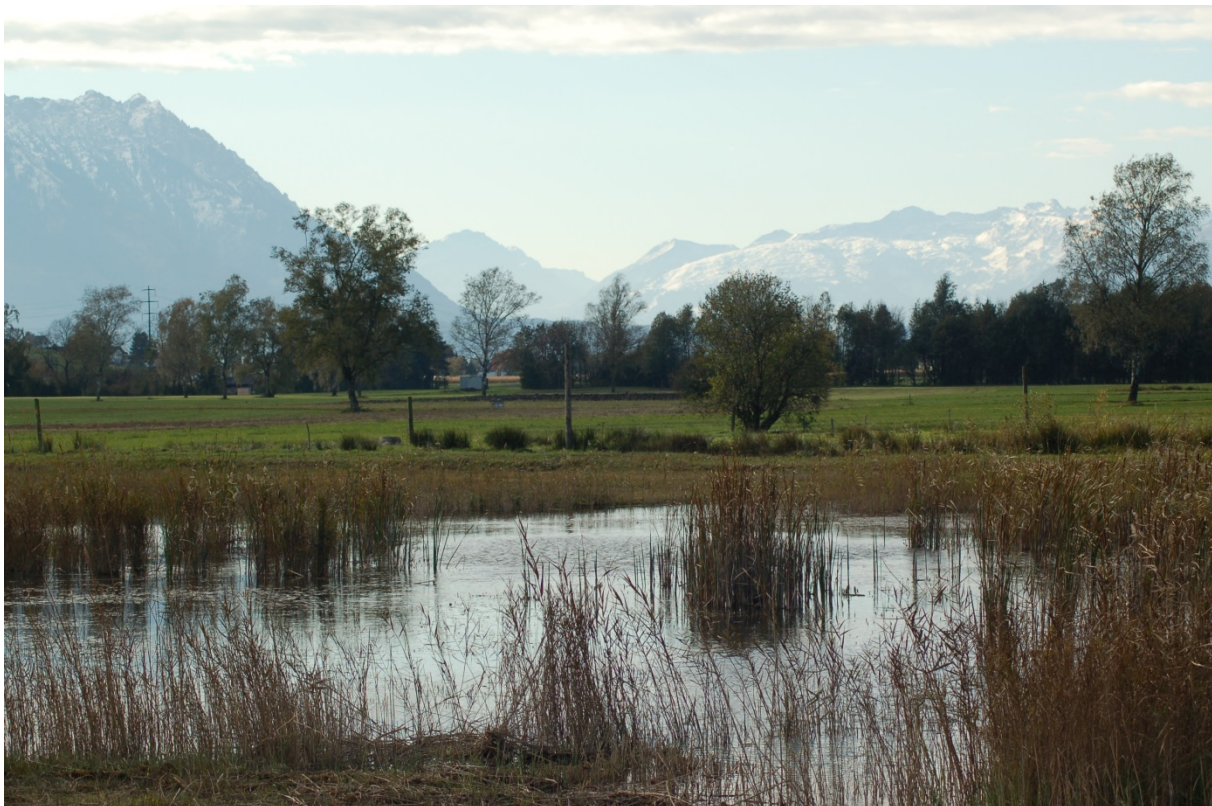
Fig. 3 This artificial wetland was created by removing the humus layer of a fertile meadow. This wetland in a former marsh is regularly visited by storks and migratory birds for foraging.

A further factor for the successful reintroduction was the provision of a network of regularly maintained aeries in the form of artificial platforms (pylons) and nesting material on roofs and on chimneys by the Rhine Valley Stork Association [19]. These were well accepted by the storks and made up half of all occupied aeries. These solid aeries were regularly cleaned and repaired if necessary. Nests in trees built by the storks are often unstable and were, if necessary, supported by pylons with platforms (Fig. 4). This did not lead to an increase of casualties. Breeding success on artificial platforms did not significantly differ (as shown) from breeding success on trees, chimneys or roofs.