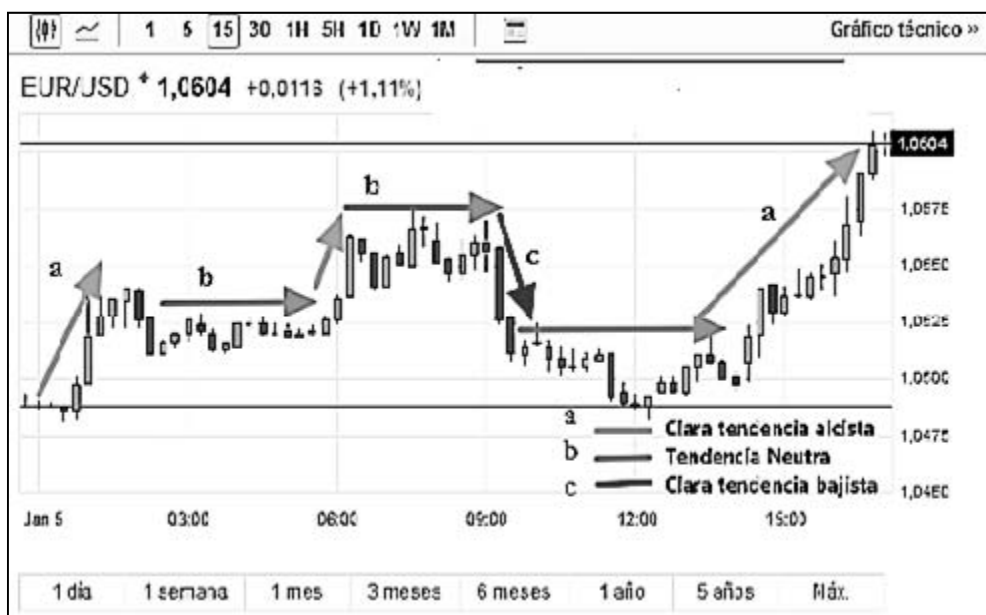
Figure 1. Trend graphs.

Upward trend (increase in the value of the asset), Downward trend (decrease in the value of the asset), and Neutral trend (stability in the value of the asset) are identified in Figure 1.