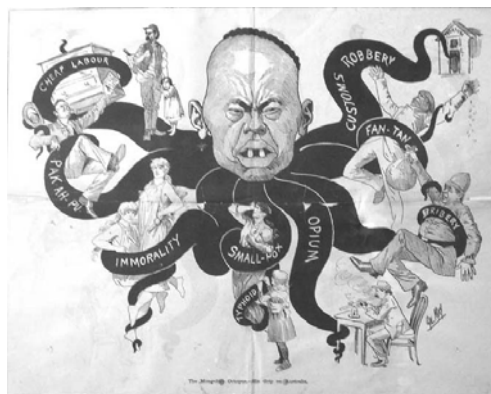
Figure 3. The Mongolian Octopus—his grip on Australia 1 .

The octopus image is not new in Australian history (Pan, 2012, pp. 253-254). One of the early images depicted a Chinese man as an octopus with eight ferocious tentacles (see Figure 3). It seemed this Chinaman brought several types of evils and viciously contaminated the land. Demonisation of China has long been embodied in historical and contemporary biases. The octopus metaphor in the 21st century targeted former Chinese President Hu Jintao (see Figure 4).