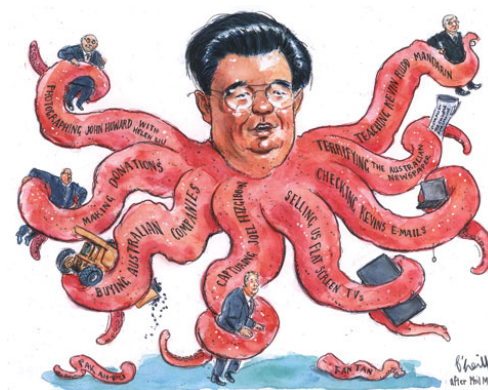
Figure 4. Hu Jintao 2 .