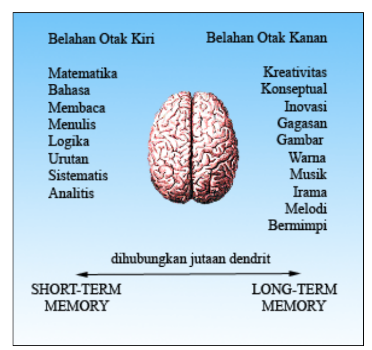
Figure 2. Left and right hemispheres.

Based on Figure 2, human brain is divided into two parts, right hemisphere and left hemisphere. Both sides of brain play different roles, the left side functions for critical thinking, and the right side functions for creative thinking.