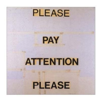
Figure 1. Bruce Nauman, Please Pay Attention Please , 1973.

King Richard III) and crying aloud: "Feed me / Eat me / Anthropology, Help me / Hurt me / Sociology". It is a figure of the subconscious, the symbol of a victim of social or personal violence, humiliated and helpless; a strong figure that signifies the endless repetition of violence and terror throughout human history. At the same time, it is also a figure of the unconscious drives, but contrary to our expectations, it presents the domination of Thanatos over Eros. The helpless crying and rotating head recalls the dark atmosphere of Shakespearian plays, where royalty equaled death and most royal characters were murdered before the end of the play.