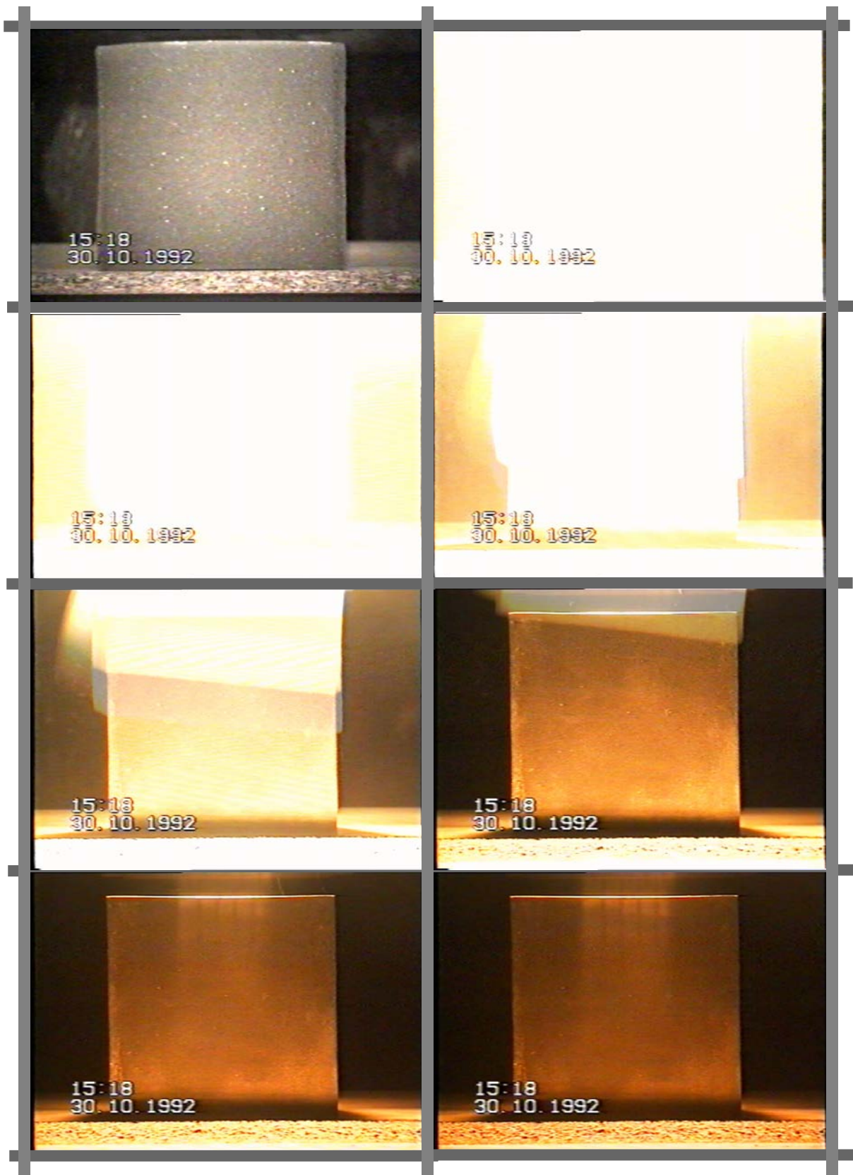
Fig. 3 The sequence of transmutation of foam rubber into gold. ©Rolando Pelizza.