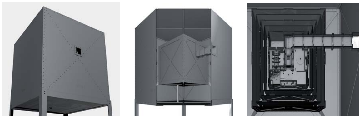
Fig. 2 Some images of the “machine”; (1) external view, (2) internal view sectioned from at an angle, (3) vertical section corresponding to the central zone.

When the scientist, Clementel saw the first experiment in 1976 he thought he was in front of a powerful laser. However, he had to rethink his opinion when he saw material positioned behind a screen being