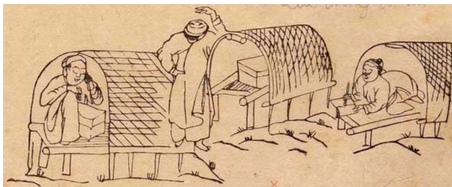
Figure 3. Henri Oger, "Examination pods" (from "Vietnamese Crafts"), printed from sculpted wooden negative, 1908.

Trong Hai under the commission of research Henry Oger (see Figure 3). This wooden print negative had an almost complete picture of culture, beliefs, traditions of Vietnam crafted into its presentation via painting language developed by Vietnamese painters, pioneers and those afterwards included.