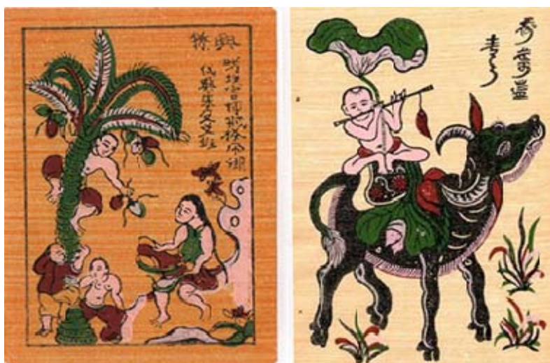
Figure 1. Dong Ho traditional painting: “Harvesting Coconuts”, “Pasture Boy Playing the Flute”.

culture at the time, it would be spotted mostly as decorative features on enameled pottery or crafts, which were subconsciously distanced from painting definitions. In creative geometry, the traditional estimative techniques in size and shape were used for most landscape contents including the human figures, with mostly popularized topics portrayed with pre-existing stories and structures. Such way of painting had been passed down from generation to generation. The depiction of the characters in shape, form, and suggestive movements are the key leads for appraisers to acquire the meanings from the collective “ancient creators” of this traditional style of painting. Most notably, the human faces in these ancient works of art were largely similar in expressions. It could be postulated that these dated norms and rigid methodology made up the reason behind painters such as Le Van Mien, Nam Son, and Thang Tran Phenh to select the humanistic topics of choice in their ventures for new, more creative expressions in oil colors.