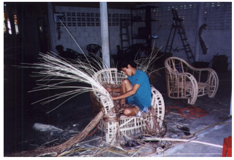
Figure 4. Workers worked in a narrow and lack of clearance space.