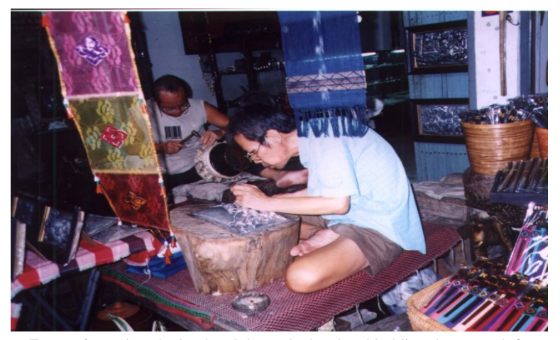
Figure 6. Workers had to bend down the head and holding the arms aloft.