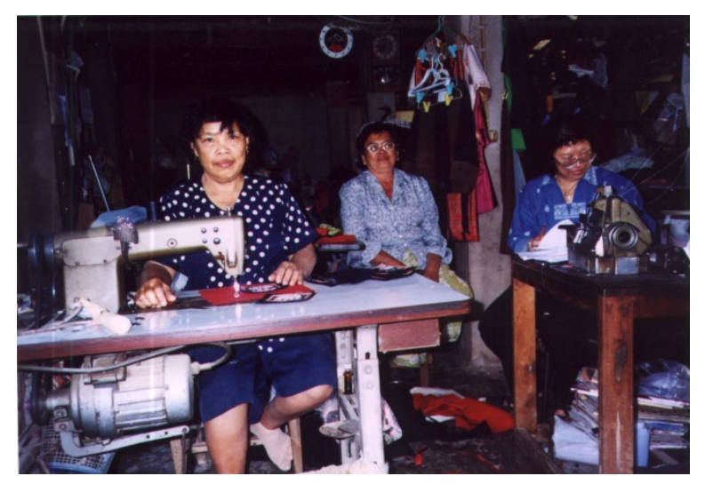
Figure 3. Workers worked in the insufficient light and air circulation environment.