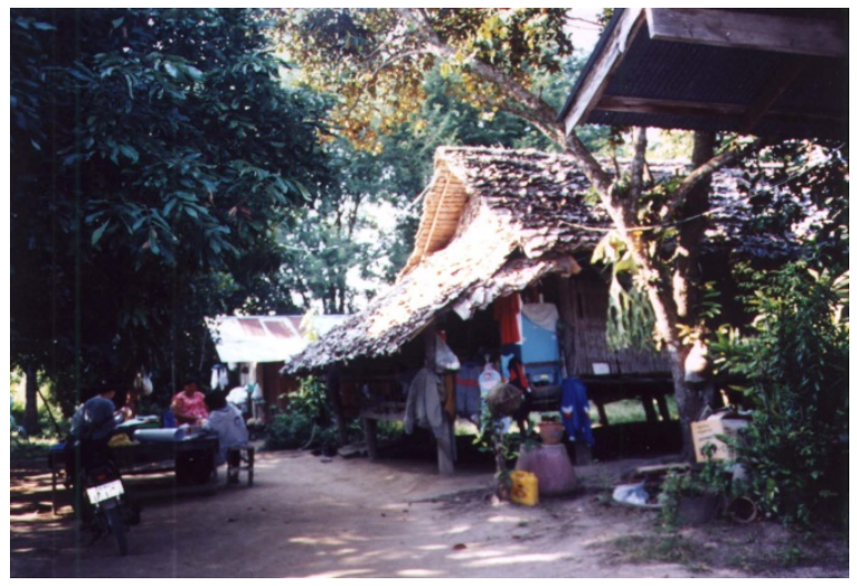
Figure 2. Workers worked in the unorganized environment and poor workstation design.