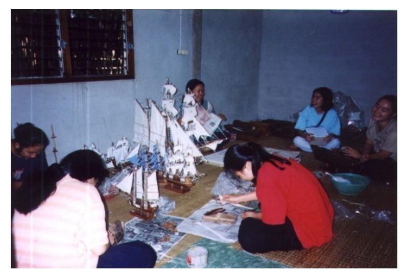
Figure 7. Workers seated on the floor without back support.