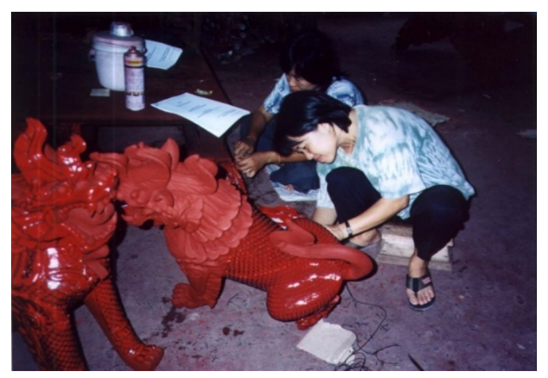
Figure 5. Workers worked for long hours in static positions.