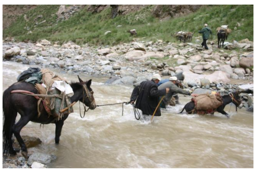
Figure 3. A scene at the source of "transporting jades from the west to the east", i.e., the Kunlun Mountain at Hetian.

Of the whole Classic of Mountains and Seas , this passage is the best part in describing and worshiping jades because of four reasons. First, what it describes is a special kind of white jade. Second, the white jade can magically transform and can produce and be produced. It turns into jade cream, and then white jade cream produces black jade. This fully demonstrates the secret of Yin-Yang change. Third, the jade cream is nutritious, being able to be the food of the Yellow Emperor who was the Chinese ancestral god; also, it is the food of ghosts and gods. This means, the jade is eatable.