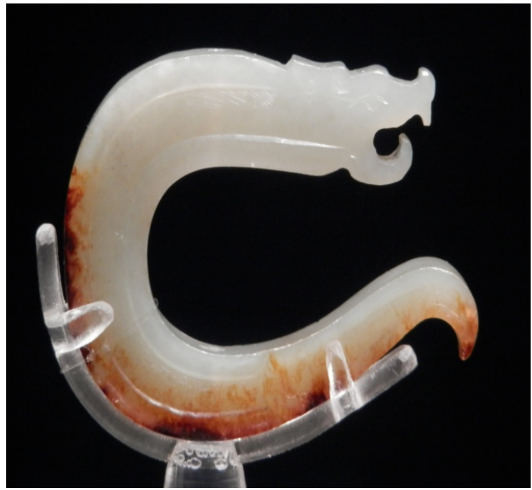
Figure 4. Photo of the white jade dragon of the Warring States Period which was unearthed in Jinzhou, Hubei Province. The photo is taken in Jinzhou Museum.

The charm of white jade resulted from a conceptual revolution of jade beliefs which was the first time in history, i.e., the worship of jades of any color to the worship of jade of pure white. I call this big revolution of mythological concepts as the "Protestant Revolution" of the jade religion. The background of this revolution was, Hetian jades of Kunlun Mountain in Xinjiang was transported into the Central Plains on a large scale, which started the new tradition of transporting jades from the west to the east which lasted for three to four thousand years. Since perfect white jades can only be found in Hetian jades of Xinjiang, the white jade worship didn't appear in thousands of years' prehistoric jade culture. It was obvious, at that time there was yet no cultural revolution of "transporting jades from the west to the east", so no white jade materials was available in producing jade sacrificial vessels or in the system of jade rituals. Once the rulers of the central plains found and started to use the white jade, the subject of worship in their ideology witnessed significant changes. Viewed from this, in Classic of Mountains and Seas , one of the 16 listed mountains that produced white jades was named as "White Jade Mountain". This is no coincidence. We can speculate this book is the secret treasure map of those devout believers after the Protestant Revolution (the white jade worship) of Chinese jade religion came into being.