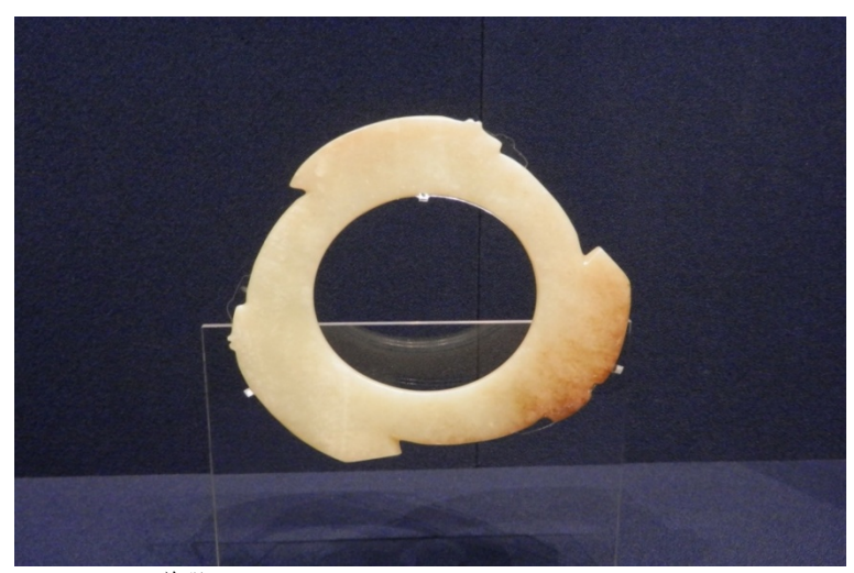
Figure 2. Photo of jade Xuanji (璇玑, according to Confucius, Xuanji is an instrument to watch the stars), taken in Shanghai Museum.

Since ancient times, the white jade has not only been high officials or royals' luxury to show off, but also a symbol of one's status. Take the belt hook made of white jades as an example. In Story of the Embroidered Jacket: the Jacket to Protect Her Beloved from the Coldness written by Xu Lin of Ming Dynasty, the hero said: "once, I also wore ... hat of horse hair, belt hook of white jade, balls of ambers, coat of ramie silk and leather boots." The jade belt hood is a luxury unique to Chinese civilization, and that made of white jade is especially precious. Cao Yan, the father of Cao Xueqin, once wrote a poem name as See the Moon at the Yellow River and Show It to Ziyou (Ziyou, the style name of Cao Yan's brother) when he was appreciating the moon at the bank of the Yellow River. In the poem, he said "only this white jade belt hook can stretch forward to the source of Kunlun", which can be interpreted as a pun. Why such a white jade belt hook "can stretch forward to the source of Kunlun"?