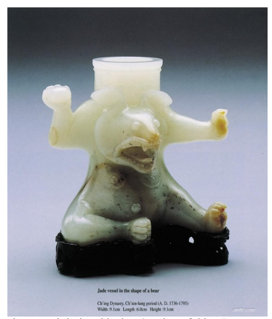
Figure 6. The white jade bear wine vessel during Qianlong's reign of Qing Dynasty, now stored in Taipei's National Palace Museum.