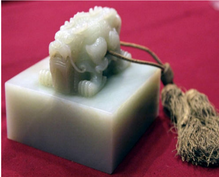
Figure 5. April 29th, 2009, the white jade seal during Qianlong Emperor's reign which was robbed from the Old Summer Palace by the Eight-Power Allied Forces (aggressive troops sent by Britain, the United States, Germany, France, tsarist Russia, Japan, Italy and Austria in 1900 to China) was sold by 1,680,000 Euros at the auction in Paris.

We can know that jade worship contains the old fantasy of immortalizing. The connection between white and dream of immortality can generate from the forever-shining stars—the sun, the moon and others. In his poem, Li Bai called the moon as "white jade plate", which vividly shows the metaphor of white jade in Chinese mythological thoughts. From the Yellow Emperor's eating jade cream to the Queen Mother of the West's presenting white jade ring, the protagonists are different in gender and identity, but what is the same is more important, i.e., the pursuit of spiritual values in jade worship and the ideal of regarding white jade as immortal and holy. The later generations usually say "Bai Bi Wu Xia" (flawless white jade, used to describe impeccable moral integrity of a man), which is the secular extension of the holy ideal. In the special cultural context of Chinese civilization, with the interaction of myths of man and jade, such thoughts and concepts came into being. On the premise of this, we can better understand the function of white jade at the Hongmen dinner (a dinner at Hongmen Where treachery—murder of the invited guest—was planned) as described in Records of the Grand Historian and why the First Emperor of Qin chose a white jade—the jade of the He family to make the Imperial Jade Seal that passed from one dynasty to the next.