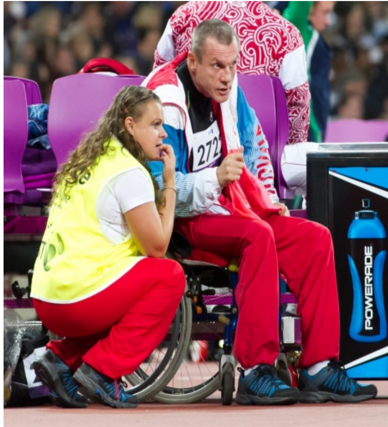
Figure 2. Concentration before performance.