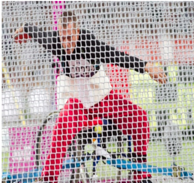
Figure 3. Performance—Discus throw.