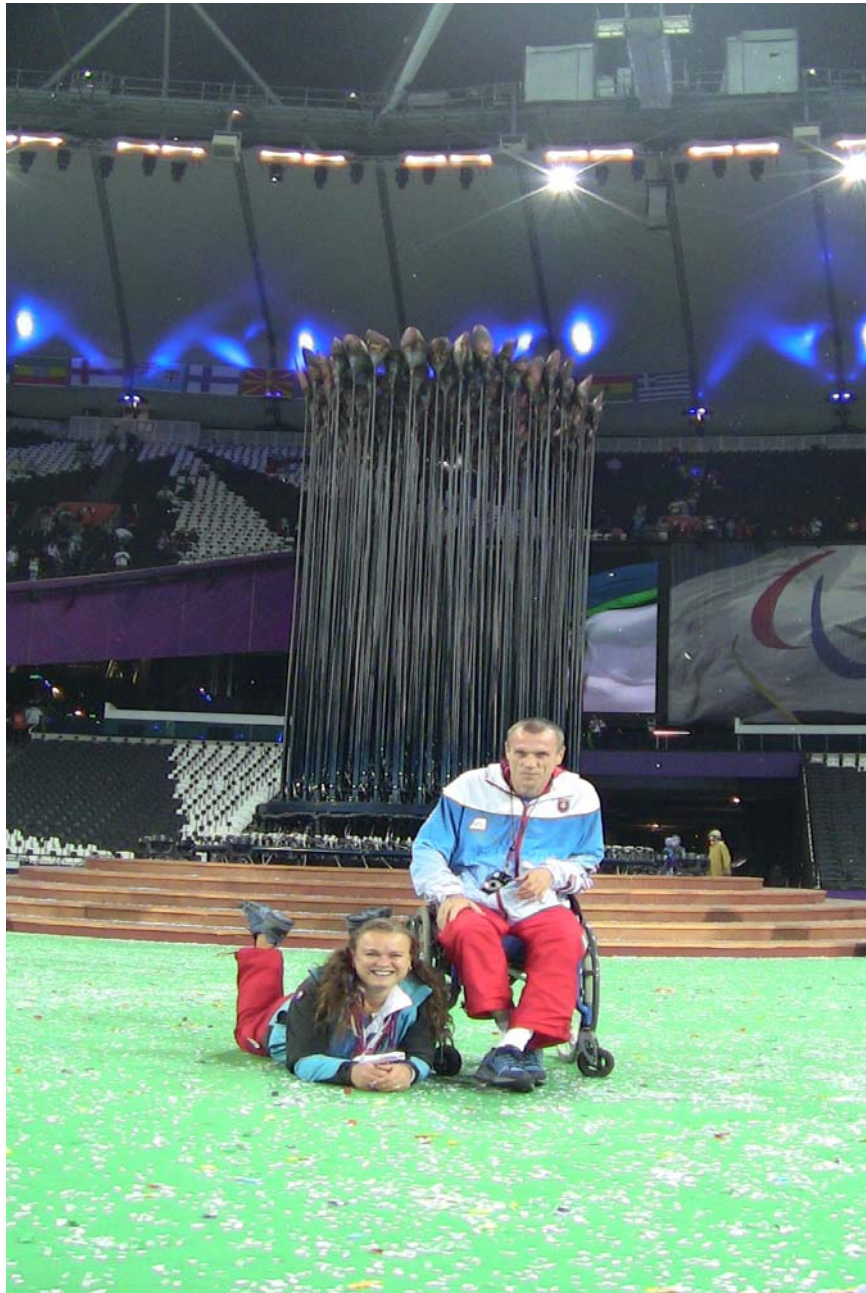
Figure 4. Happiness end of summer paralympic games in London.

Talent and effort are precious phenomena, which need to be protected and developed. In case of disabled people, it is even rarer, more important, and more urgent. We are sure that we will do a lot of useful things for development of active, diligent talents among disabled people (Bardiovský, Požár, & Píteková) (see Figure 4).