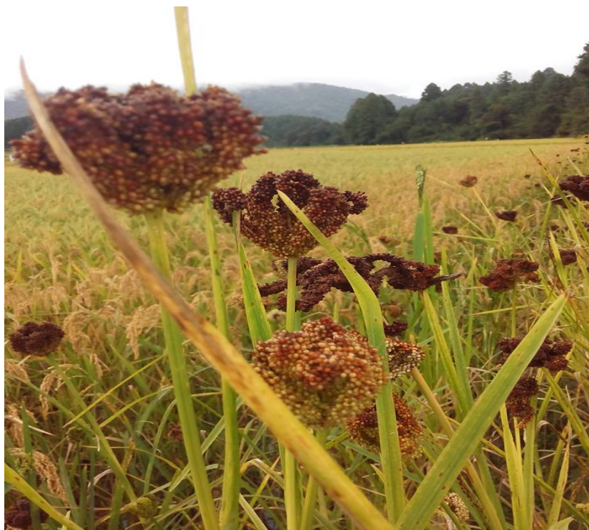
Fig. 4 Ripened indigenous millets ( Eleusine coracana Linn. Gaertn.) cultivated in the elevated bunds between the rice plots by the Apatani tribe in Ziro valley of Arunachal Pradesh, India.