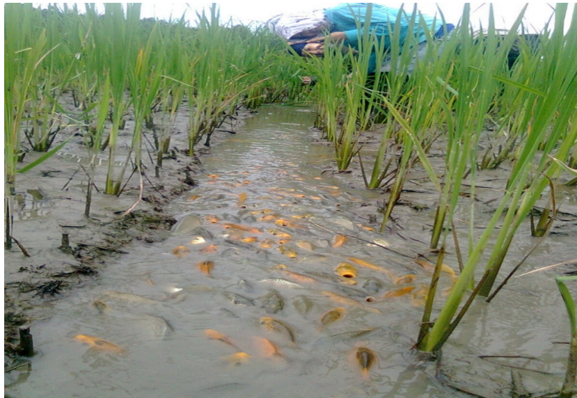
Fig. 5 Harvesting of fishes from integrated rice + fish farming in Ziro valley of Arunachal Pradesh, India.

shelter to fish. When water dries up in the field, fish takes shelter in these trenches where water still remains. During hot weather, the water in deep trenches provides soothing environment for the fish. Fishes are caught easily even during the harvest from the trenches using the indigenous trap prepared from bamboo which is placed in the outlets. About 80 percent of fish production in the valley comes from Cyprinus carpio followed by Ctenopharyngodon idella . Cyprinus carpio , an omnivore, stands out from other fish species because of its high viability. They can lay eggs under natural conditions in ponds or lakes, making it easy for farmers to collect them. If left unattended in the field, these eggs are even able to hatch out. This is the reason why Cyprinus carpio is the main fish species used in rice + fish systems [13].