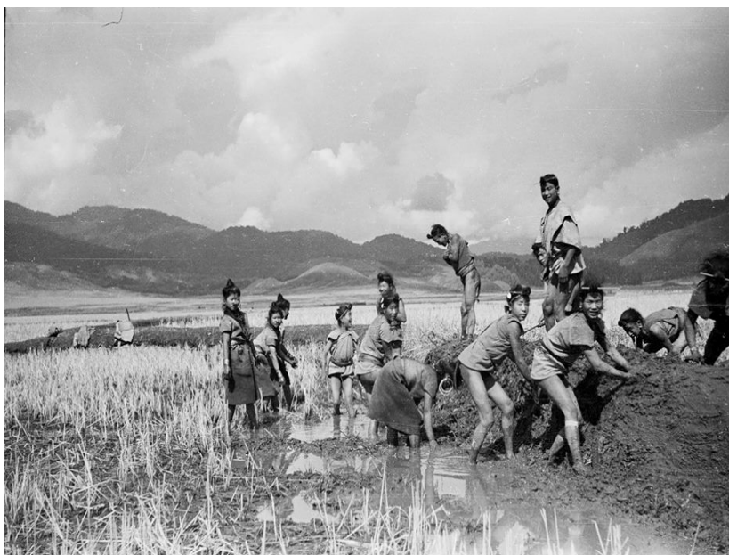
Fig. 2 The rural Apatani farmers of Ziro valley, Arunachal Pradesh, India preparing their agricultural land for cultivation.

decomposition [11]. The weeds collected in February from bunds are used as compost for rain-fed garden, mainly for cultivation of chilies ( Capsicum spp.). Certain species such as Houttuynia cordata Thunb is considered as a good soil binder and is used for stabilizing bunds and are left behind in the field while weeding. Some weeds are consumed by fish so that weeding operations in the integrated rice + fish farming can be less frequent than in other agricultural systems where weeding is done three to five times during a cropping season.