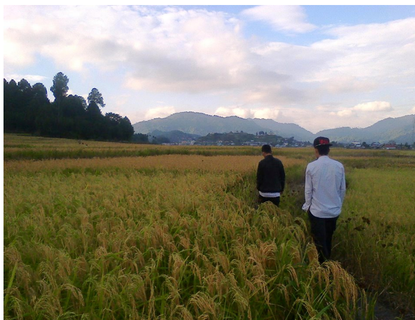
Fig. 3 Ripened indigenous landrace of rice ( Oryza sativa Linn.) in Ziro valley of Arunachal Pradesh, India, where the local farmers practice ingenious rice + fish cultivation.

* Now become extinct due to lesser use of the species.