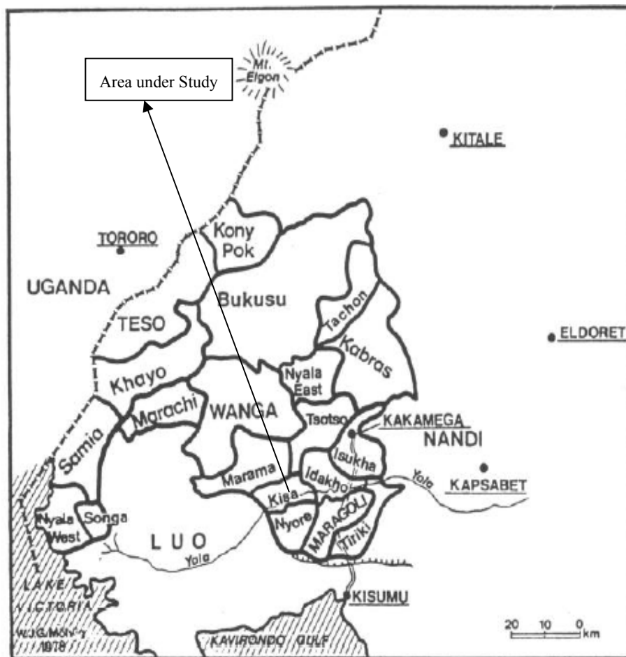
Figure 2. Luhya dialect map. 4