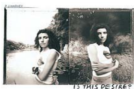
Figure 4 Is This Desire? Album Cover.