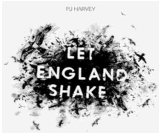
Figure 8 Let England Shake Album Cover.