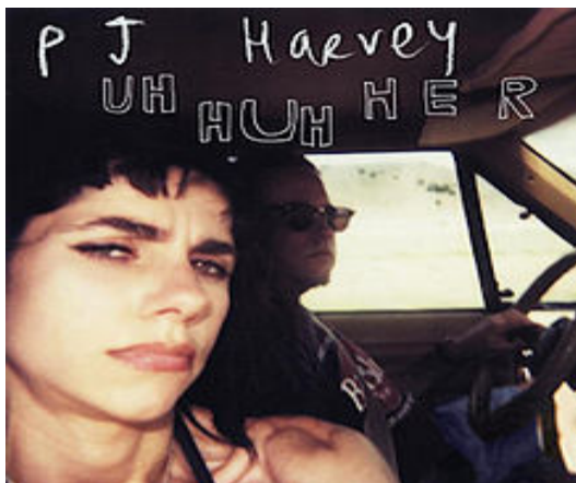
Figure 6 Uh Huh Her Album Cover.

2004 released studio album Uh Huh Her 's cover has only neutrals as colors contrasting with black areas. Positive and negative areas divides surface into areas. Viewer failed to understand which is front which is back. Size contrasts, tonal contrasts and the free style typography makes the cover as dynamic as it can be. The handwriting and hand drawing letters are floating on a dark space and differ the musician and the name of the album. On every cover there are references to the musicians self and the world inside her.