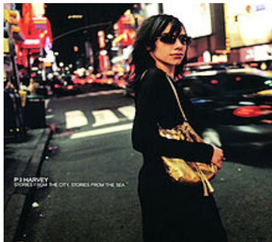
Figure 5 Stories from the City, Stories from the Sea Album Cover.