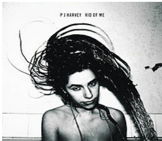
Figure 2 Rid of Me Album Cover.