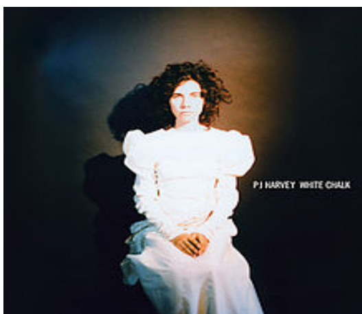
Figure 7 White Chalk Album Cover.