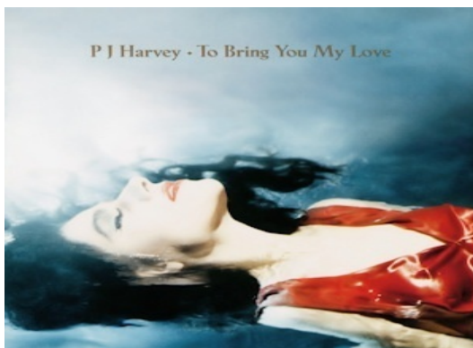
Figure 3 To Bring You My Love Album Cover.