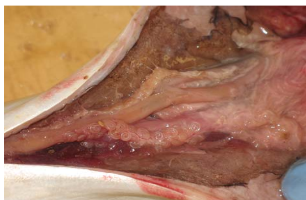
Fig. 1 Larvae of Anisakis spp. in body cavity of mackerel ( Scomber scombrus ).

Food and Agriculture Organization of the United Nations (FAO) prepare a report, which provides information on the prevalence of Anisakis simplex larvae of several species of high economic importance (Table 1). In some cases, 100% of samples from wild fishes were infected with Anisakis simplex larvae. However, parasites were not found in any fish from aquafarming [13]. A retrospective analysis of literature data on Anisakidae prevalence suggests that their life cycle depend on water salinity and the presence of small shrimp-like crustaceans (Fig. 2). For example, in a study conducted on fish from the coast waters of Portugal, L3 larvae of Anisakis spp. were found in 100% of the European hake ( Merluccius merluccius ), 95.6% of Atlantic mackerel ( Scomber scombrus ), 93.8% Blue whiting ( Micromesistius poutassou ), 75.9% of the examined Atlantic horse mackerel ( Trachurus trachurus ) and 6.8%-28.1% of