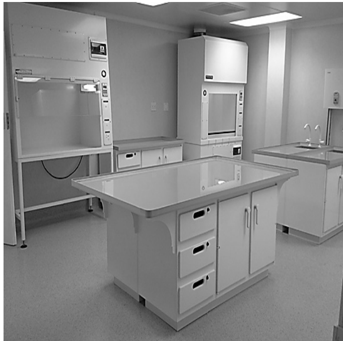
Fig. 2 Part of Necsa's new nuclear forensics laboratory under construction.