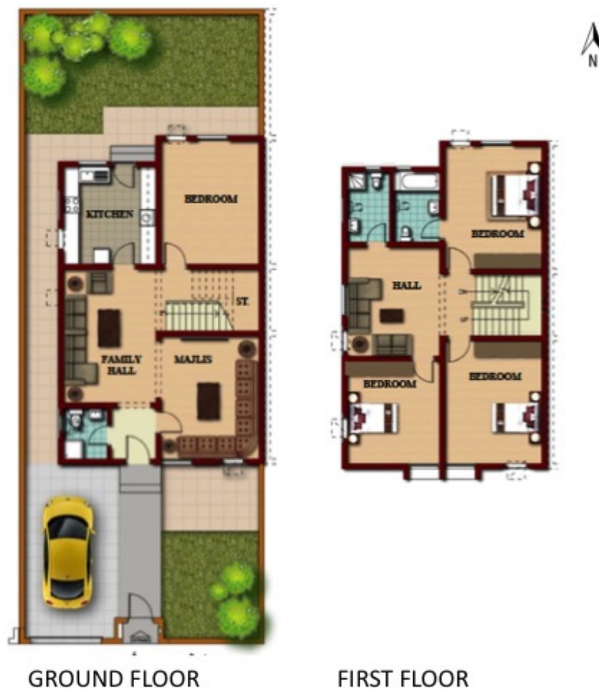
Fig. 2 Case study floor plans.

The internal loads, including occupants, lighting and other appliances are approximated to be 5 W/m 2 of sensible load and 3 W/m 2 of latent load. The thermal comfort zone is between 18 °C and 26 °C. The house was set to a daily profile associated with mix mode mechanical system that is used to provide cooling system but not heating as illustrated in Fig. 3. The weather file used to simulate the weather of Bahrain is that of Kuwait since it is the nearest to Bahrain in both location and weather conditions.