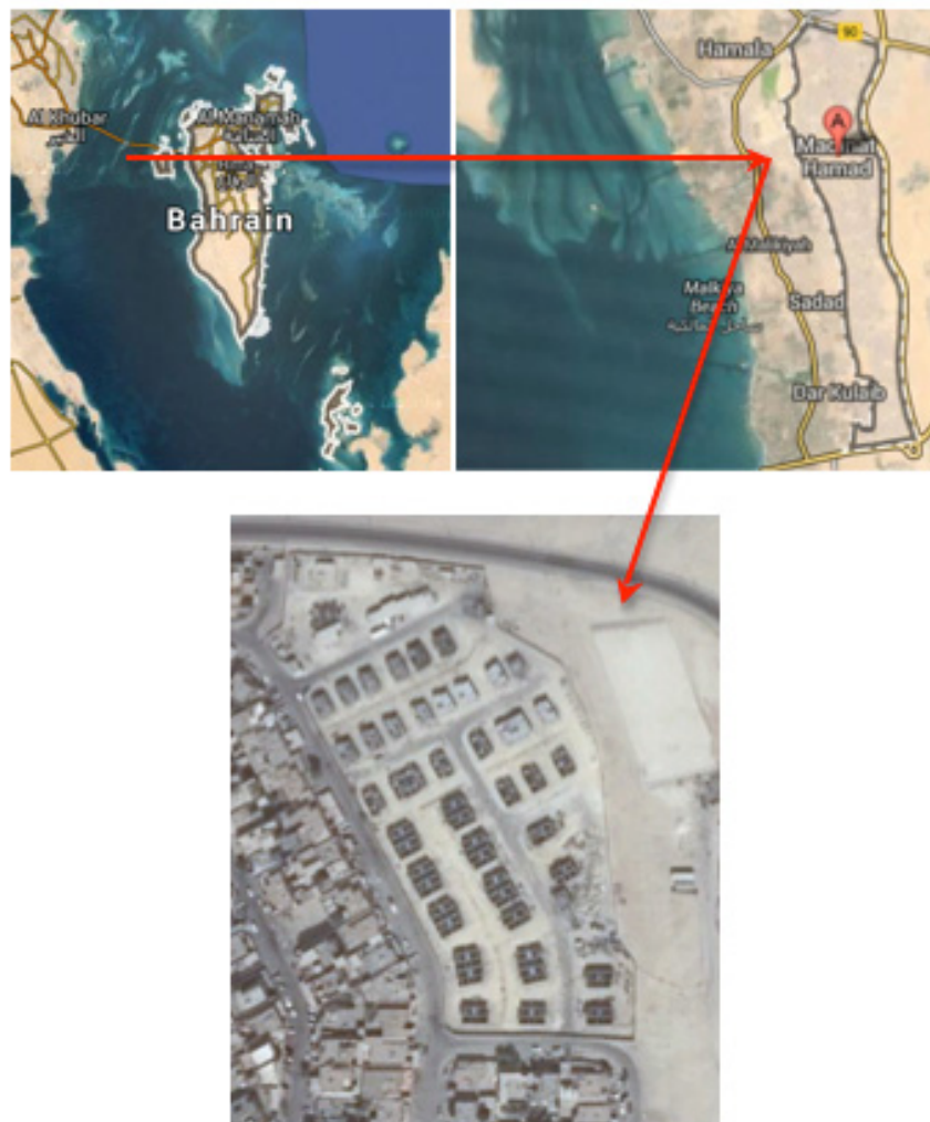
Fig. 1 Case study location in Bahrain.

Late in 1984, Madinat Hamad was set up in northern Bahrain as a new affordable housing city for those residents who cannot afford to own a house in the city centre. This city has a high percentage of social housing when compared to the private housing units in the city and expected to grow more and more with the current progressive developments. Therefore, a typical 2 storey-housing unit located in Madinat Hamad among a new development of 48 standard housing units over a total plot area of 2.5 hectares (Fig. 1) has been selected as a case study for this research.