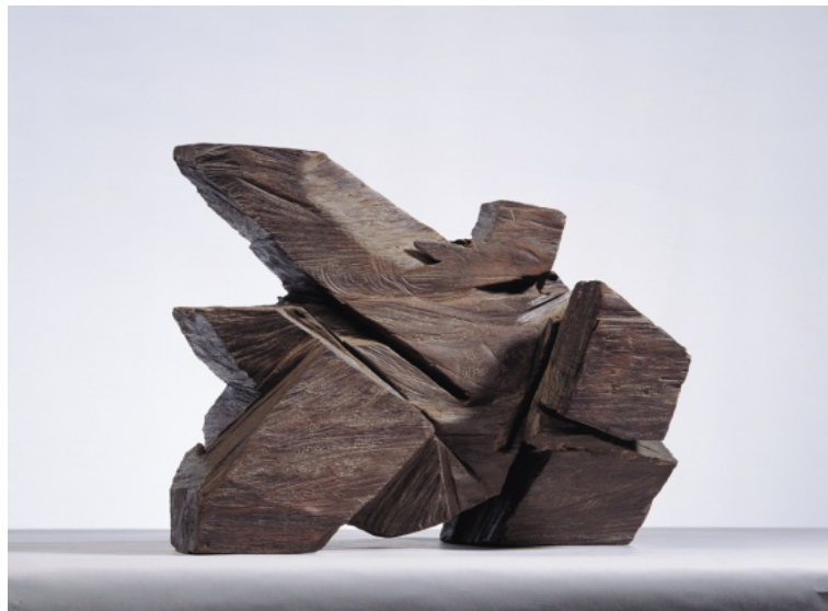
Figure 3. Sculpture <Tai Chi>, JU Ming.

In this area, the sculptor who named JU Ming, from Taiwan, has a great achievement. He took the 70s century native Taiwanese culture as the entry points to his performance. We can find this expression in the work named “Tai Chi Series” (see Figure 3) and the work “World Series”. These works are both from the essence of traditional Chinese culture, and he used the strength of character in shaping China. He always worked with nature, because he believes that his own life can bring the true feelings to him, which may be adopted in his work. “Tai Chi” is the essence of Chinese tradition culture; it is from the origin of the universe and reflects the running of life. ZHU Ming successfully used these complex and esoteric philosophy concepts to create his work. From this series of “Tai Chi”, we can see the great ideas of classical Chinese philosophy of Heaven and its majestic great charm. This traditional charm and cultural heritage is worthwhile for every Chinese people to learn.