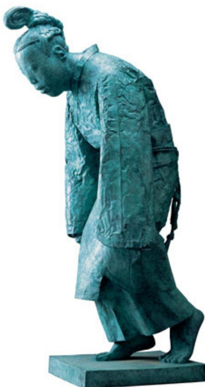
Figure 4. Sculpture < Motherland: the Wind >, CAI Zhi-song.

When we are going to understand more of Chinese traditional art forms, it is significant to learn Chinese philosophy. It is the core of Chinese culture, and it also reflects the development of all art. Therefore, the expression of philosophy has a close relationship with sculpture, in other words, the expression of sculpture can be seen as an art form, and it can also be an outward expression of philosophical thought. So, when we can understand our ancient sculptures, we can also deeply appreciate our philosophy, which is very important for our cultural development.