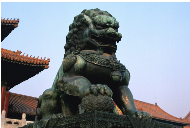
Figure 1. The bronze lions.

Ethical code has always been an important part of the Chinese culture, in ancient society, people always believe in God. Generally speaking, the ancient pottery, bronzes, jade, and lacquer wares are basically used for decoration and ritual, ultimately derived from the practicality of sculpture, and sculpture has a great significance in the development of the dynasties. Funerary objects are funerary goods, while sculptures occupy a larger proportion of the funerary articles. Shaping with plenty of decorative techniques can make the Buddha's shape more solemn. For example, in our shape of classical sculptures, lions evil always gives a very imposing, brave, and more sacrosanct psychological feeling to people, this is because the overall shape has a lot of decoration, which make them play a role as the lion architectural decoration (for example, see Figure 1).