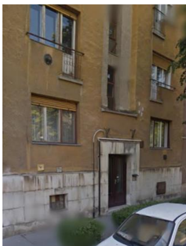
Fig. 8 The house of the Gerle family at 15 Bank Ban, Budapest.