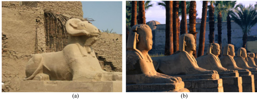
Fig. 2 (a) Ram-headed sphinx; (b) sphinxes added by Pharaoh Nectanebo I [1].