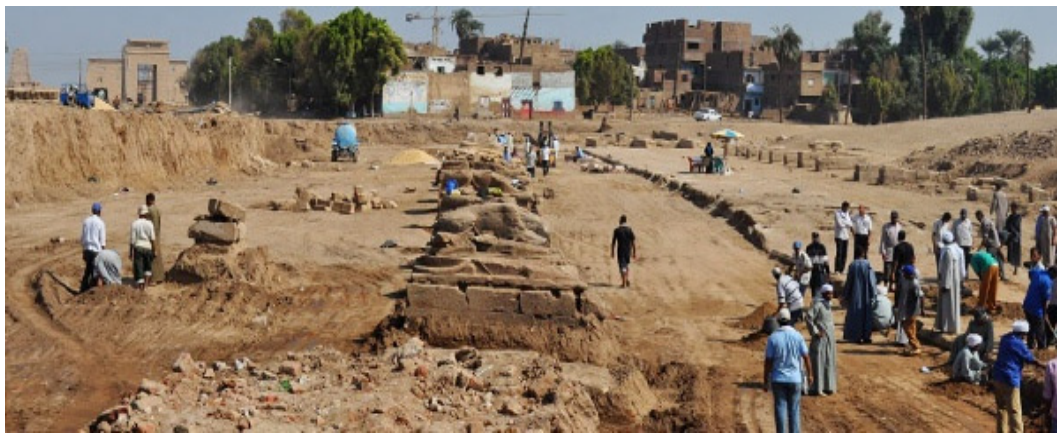
Fig. 3 Part of the excavations along and around the Avenue of Sphinxes [8].

street level depending on location (Fig. 3). If the original length of the avenue (2.4 km) is fully excavated, there is the potential risk of creating a “trench” that segregates Luxor’s urban fabric into two linearly isolated stretches;