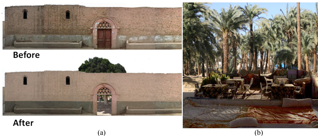
Fig. 7 (a) The folks' house before and after restoration (developed by the research team); (b) the touristic potential of the palm grove: shaded seating area for refreshments.