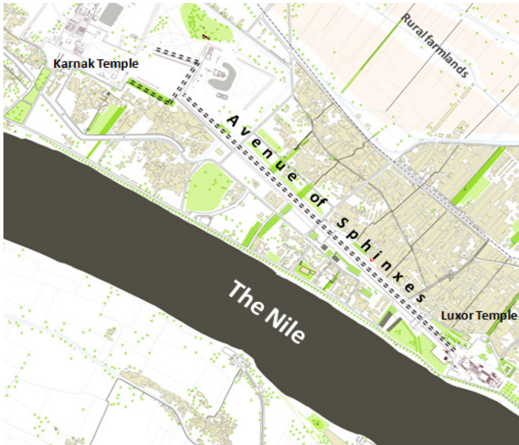
Fig. 1 A CAD (computer aided design) map of the city of Luxor: The Avenue of Sphinx is graphically denoted as the thick dotted line.

visited this avenue during her Nile trip with Mark Anthony to implement restoration works.