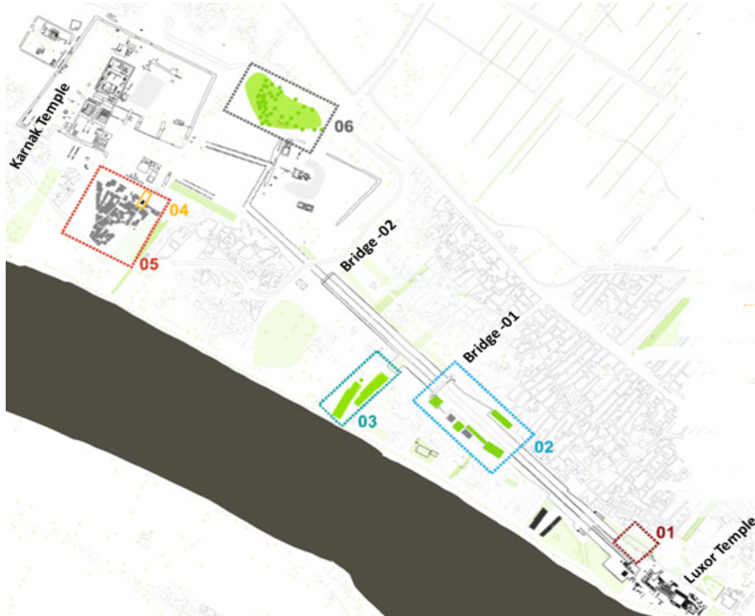
Fig. 4 The six stations suggested by the project: (1) Antiquarium; (2) green terraces; (3) pharaonic and public gardens; (4) folks' house; (5) quality crafts neighborhood; (6) palm grove (developed by the research team).

• Green terraces surrounding the bridges: New spaces of congregation and rest are strategically deployed in the immediate vicinity of two bridges suggested by the project to overcross the avenue (Fig. 5). Pedestrian ramps and stairs connect the avenue to