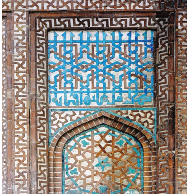
Figure 8. Glazed tile müsaics of the window on the right of the right on the etrance at the Tomb of Keykavus in Sivas.

mosaic-like pattern (Ozel, 1999, p. 87). Custom glazed tile pieces in the form of medallions, stars, cones, etc., have also been produced. To create the mosaic pattern, small pieces of tile are laid down on a flat or curved surface. Later, gypsum plaster is poured on the back of the pieces to seal them in place. Once the plaster is dry, the mosaic can be mounted on the surface it was intended for. Glazed tile mosaics have been widely used as architectural decoration owing to their ability to conform to both flat and curved surfaces (Çeken, 2008, p. 20) (see Figure 8).