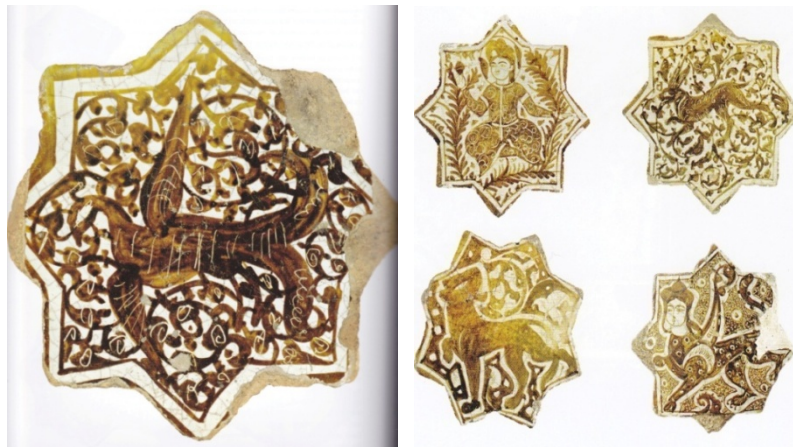
Figure 6. Eight pointed luster star tiles with various designs found in-situ at the Great Palace in Kubad Abad. Karatay Museum Konya.

The best Anatolian Seljuk luster tiles use opaque white glaze under the luster layer (see Figure 6). The luster is applied on top of turquoise, purple, green, and dark blue glazes. In all the Seljuk architecture, the greatest variety of luster tiles is to be found at the Kubad Abad palace in Konya. The tiles of the Kubad Abad Palace, the walls of which are covered with stars and cross-shaped human and animal figures, are important examples of this technique.