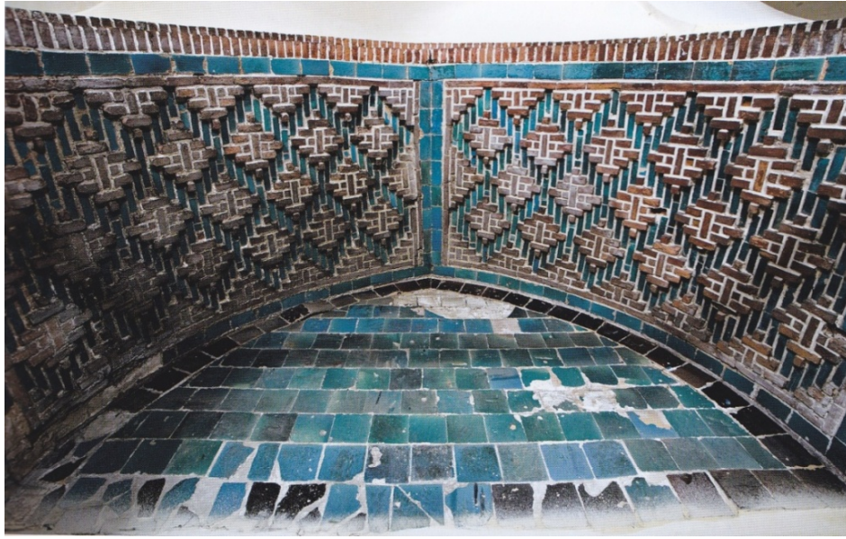
Figure 3. Monochrome glazed tile and glazed brick, Arch at the atrance from the mosque to the tomb in Gök Madrasa, Amasya.

Monochrome glazed tiles are produced by applying a transparent or opaque glaze to tile biscuits of varying sizes. The glaze is usually applied without a primer. Turquoise, purple (aubergine), dark blue, white, and green are frequently used on this type of tile. In the Seljuk and Beylik periods, the technique was applied to square, rectangular, hexagonal, eight-pointed star, cross-shaped, lozenge, and butterfly-shaped tiles. An important point to make at this juncture is that there is a different technique that produces results similar to monochrome glazing. In this technique, monochrome dye is applied to the tile biscuit, which is later glazed and fired. This is a form of underglaze painting. While it produces similar results, it should not be mistaken for monochrome glazing. Monochrome glazed tiles were used extensively on both religious and public buildings as well as palaces in the Seljuk and Beylik periods (Çeken, 2008, p. 15) (see Figure 3).