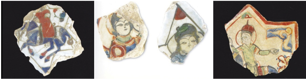
Figure 7. Examples of Minai tiles Konya Aladdin Kiosk (the Kılıç Arslan II Kiosk). Konya.

The most common patterns and designs in artistic tile panels from this time were stars, crosses, squares and diamonds, accompanied by throne scenes representing court life, various hunting scenes and especially flowers. However, the most interesting figures are the various animals related to hunting and the imaginary or magical animals. Such creatures as the sphinx, siren, single, and double-headed eagles, singles, and paired peacocks, paired birds flanking the tree of life, and dragons create a magical world of the imagination. They are all symbolic representations of the rich figural world of the Seljuks (Ozel, 1999, p. 88). Fine examples of these tiles can be seen in the Konya Aladdin Kiosk (the Kılıç Arslan II Kiosk) (see Figure 7).