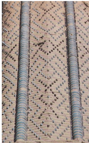
Figure 2. Glazed brick, İnce Minareli Madrasa (Konya, 1264).