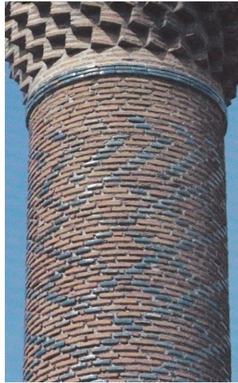
Figure 1. Glazed brick, Afyon Ulu Mosque. Source: Afyon (1272).

The most frequently encountered type of architectural decoration from the Anatolian Seljuk period involved the use of glazed brick in which glazed (and also unglazed) bricks were arranged to produce a variety of patterns, mostly on the facades of buildings (see Figures 1-2). Mosques, mescits (small mosques), and minarets were decorated with turquoise and purple and reddish glazed brick to produce a variety of geometric compositions and kufic inscriptions (Ozel, 1999, p. 86). Turquoise was the most frequently used color for glaze although cobalt blue, eggplant violet, and sometimes black were also popular. Glazed bricks were often used in conjunction with unglazed red bricks to form complex patterns, such as the dome decoration of the Ulu Mosque in Malatya (1247). Examples of glazed brick minarets are the Taş Madrasa (Aksehir, 1250), Yivli Minaret (Antalya, late 13th century), Sahib Ata Mosque (Konya, 1258), the Gök Madrasa and Çifte Minareli Madrasa (Sivas, 1272), and Afyon Ulu Mosque and the İnce Minareli Madrasa (Konya, 1264).