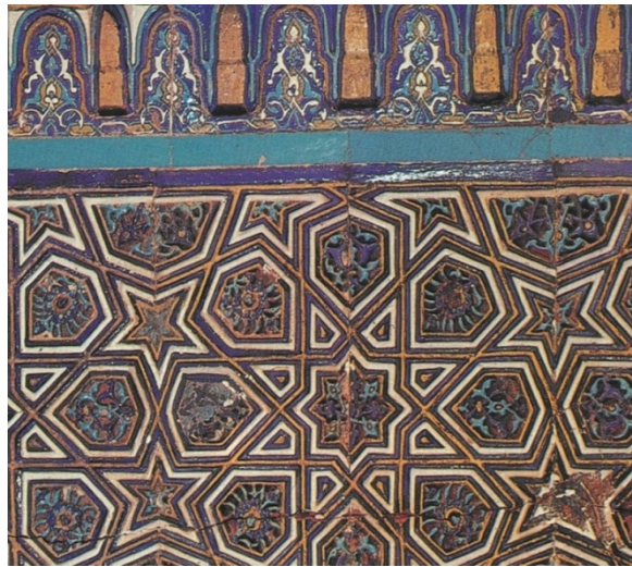
Figure 10. Colored glazed tile decoration of Bursa Green Mosque.

This technique, which is not seen until the first half of the 15th century in Anatolian glazed tiles, became popular mainly in the Early Ottoman period and was further developed following this era. In the Beylik period, outside of Ottoman territory, the best example is the prayer niche of the Karamanoglu Ibrahim Bey Imaret (complex) (R. Arık & O. Arık, 2008, p. 21).