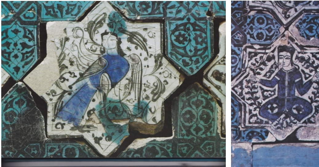
Figure 4. Underglazed painted tiles of the Kubad Abad Palace in Beysehir, Konya, 1272. Source: R. Arık and O. Arık (2008, p. 133).

Fine examples of these tiles have been discovered at the excavations of the Kubad Abad Palace in Beysehir, where the tiles are decorated with plant motifs as well as with figures of human beings and animals (see Figure 4). Typically, the tiles are white, eight-pointed stars and have delicate figural paintings of humans and animals, including some of the best in Anatolian Seljuk representational art. Painted with an underglaze in turquoise, green, purple, and blue, these figural tiles are set on a back ground of cruciform turquoise tiles with arabesque motifs in black.