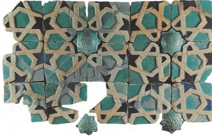
Figure 11. Example of the faux mosaic technique. Tile decoration of Bursa Green Mosque.

In addition to these techniques, the faux mosaic technique (glaze engraving) was used during the Seljuk period. This technique entails engraving a glazed tile to reveal the underlying clay. The engraving is done according to a pattern, thus creating a mosaic effect (see Figure 11). Examples of this technique can be seen in the Malatya Grand Mosque and the Sahipata tomb in Konya.