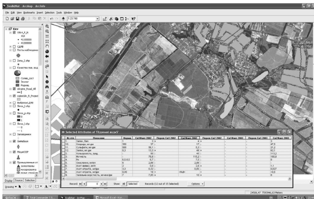
Fig. 3 Operating window ArcGIS.