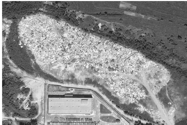
Fig. 1 Solid waste landfill in the Ternopil region, Ukraine.