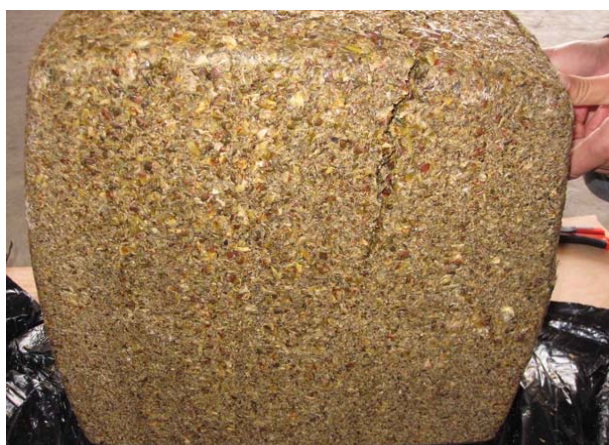
Fig. 4 Pineapple's residues.

As pineapple is widely used, either by final consumers or by the industry as raw material, much of this research chose agroindustrial waste (from pineapple processing, Fig. 4 [27]), as crude extract to get the target-molecule with same quality as obtained from its pulp.