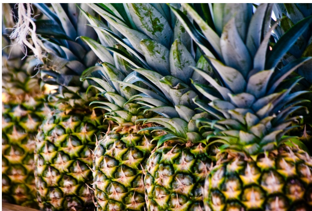
Fig. 1 Ananas comosus .