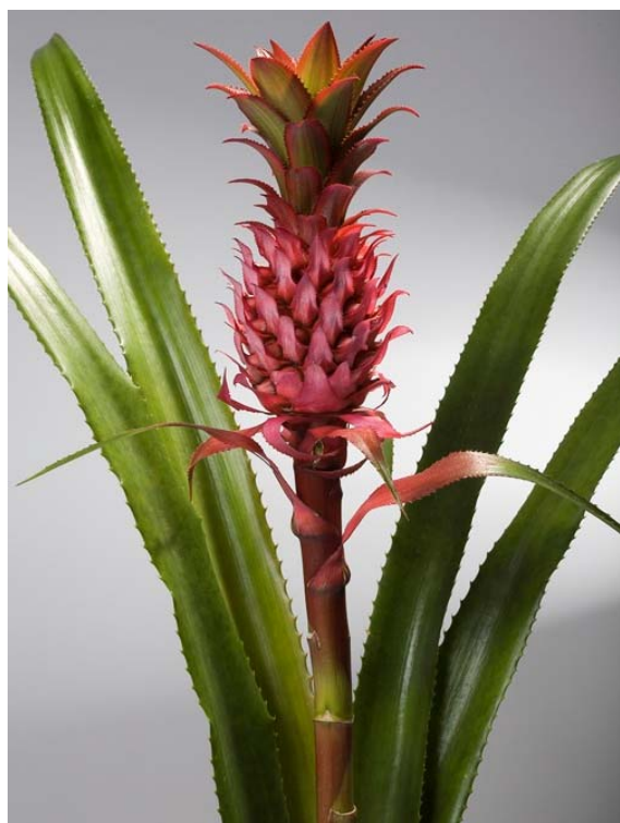
Fig. 2 Ananas erectifolius .