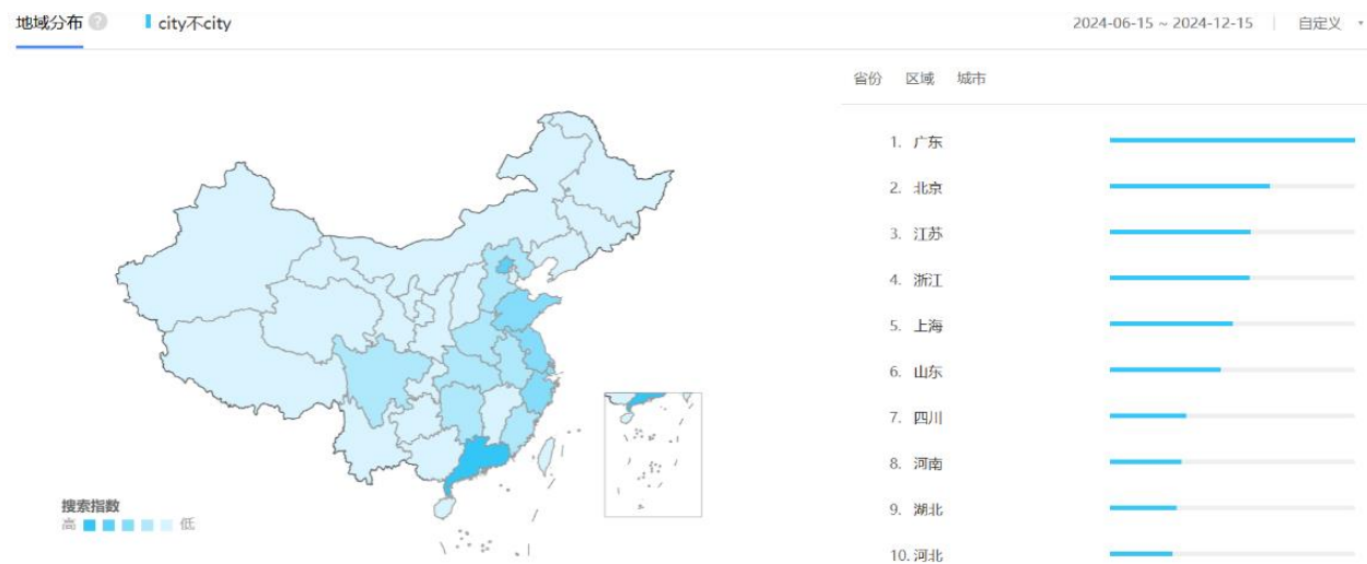
Figure 3. The macro spreading state of “city bu city” in different provinces of China.

The current research collected data within the period from June 15, 2024 to December 15, 2024 (see Figure 2). As time went by, the frequency of “city bu city” exhibited an upward trend, indicative of its rising popularity among the general populace. The fluctuation range reached its zenith in July, coinciding with a notable event related to this neologism when the Ministry of Foreign Affairs spokesperson mentioned “city bu city” and called for tourists to visit China. Despite the subsequent decline in frequency within the same month, which indicates the short-live feature of Internet neologisms, a relatively stable contingent of netizens in China continues to use this neologism to express their ideas and attitudes in China Internet. On the other hand, netizens in some provinces,