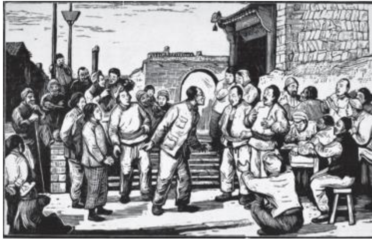
Figure 2. "Comrade Ma Xiwu's Mediation Lawsuit" (Ancient Yuan).

Comrade Ma Xiwu wearing cadre clothes in the center of the woodcut picture, behind him is the common door blank, in order to highlight his subject status, in addition, the eyes of other natures in the picture are focused on him, creating a central subject atmosphere of Comrade Ma Xiwu. Let the viewer see at a glance who is the central figure in the crowd. This woodcut also reflects the social spiritual core of the government represented by Comrade Ma Xiwu in promoting the freedom of marriage and advocating women's liberation during the revolutionary War of Resistance, and it is also an artistic presentation of the spirit of the people, as shown in Figure 2 (Li, 2022, pp. 65-67).