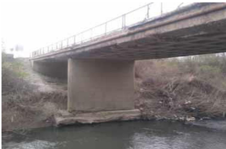
Fig. 4 Bridge 1: abutments and piers at the time of inspection, with visible signs of scouring.