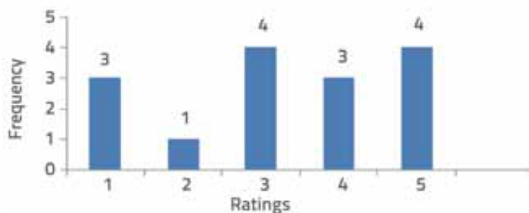
Fig. 3 Distribution of ratings for abutment and pier foundations (Bridge 1).

engineers who decided to give a medium ranking (3) probably did recognize the damage but did not consider it to be a menace to safety. Median measures a mean value, i.e. a place in the centre of the group of ratings in the statistical distribution, and in such a way one half or ratings in the group has a value greater than the median, while the other half of ratings in the group has a value smaller than the median. According to the data, it is clear that the distribution of results according to standard deviation meets the condition of a < 1.0 for the group of damage ratings according to median 4 and 5 which represent considerable damage to the elements, i.e. their full uselessness. This means that one half of the damage presenting considerable threat to the structure was assessed within limits of the level of damage for one higher/lower rating. This data shows a satisfactory accuracy for visual observation which has been divided in this study into five levels.