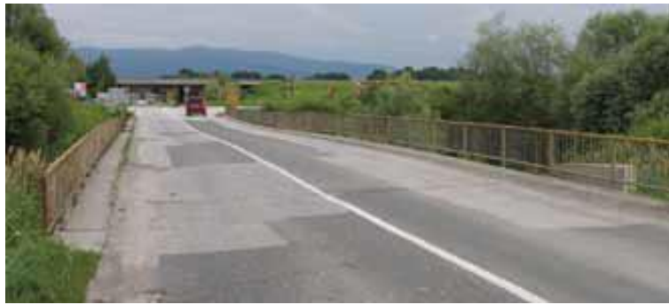
Fig. 5 Pavement and railing of Bridge 1.

Mode is a form of qualitative or quantitative property that occurs most frequently, i.e. a form of property with highest number of reiterations or with highest frequency. In case of nominal properties, the mode is defined by counting. For damage ratings with the reiteration frequency mode for more than one half of 15 respondents ( f > 8 ), the correspondence was registered in 62% of the total number of elements under study. Considering the odd sample of respondents, if the limit of the reiteration frequency mode is reduced to f > 7 , the correspondence amounts to satisfactory 75% for the total number of elements under study. Inspectors mostly agree with one another with regard to visible manifestations of greater defects.