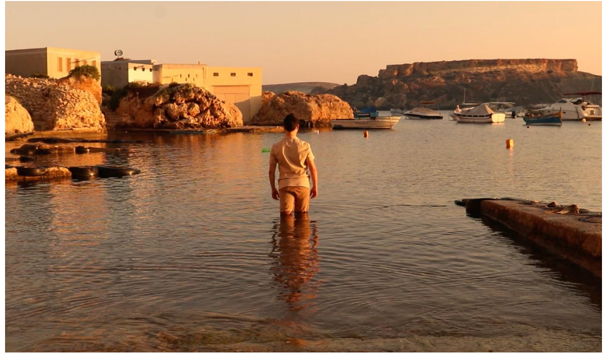
Figure 8. The beach. In the final fragment of the production the dancer embraces the power of the sea, in a fresh baptismal which will allow humans to re-establish a communal partnership system of hope, recognition, and love.