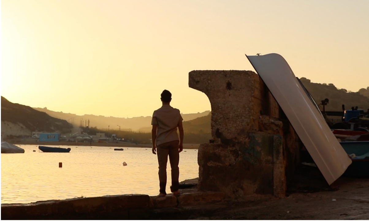
Figure 7. The beach. The dancer contemplates the Maltese land and sea, thus acknowledging humans' needed reconnection with the environment and the spaces that allow existence.