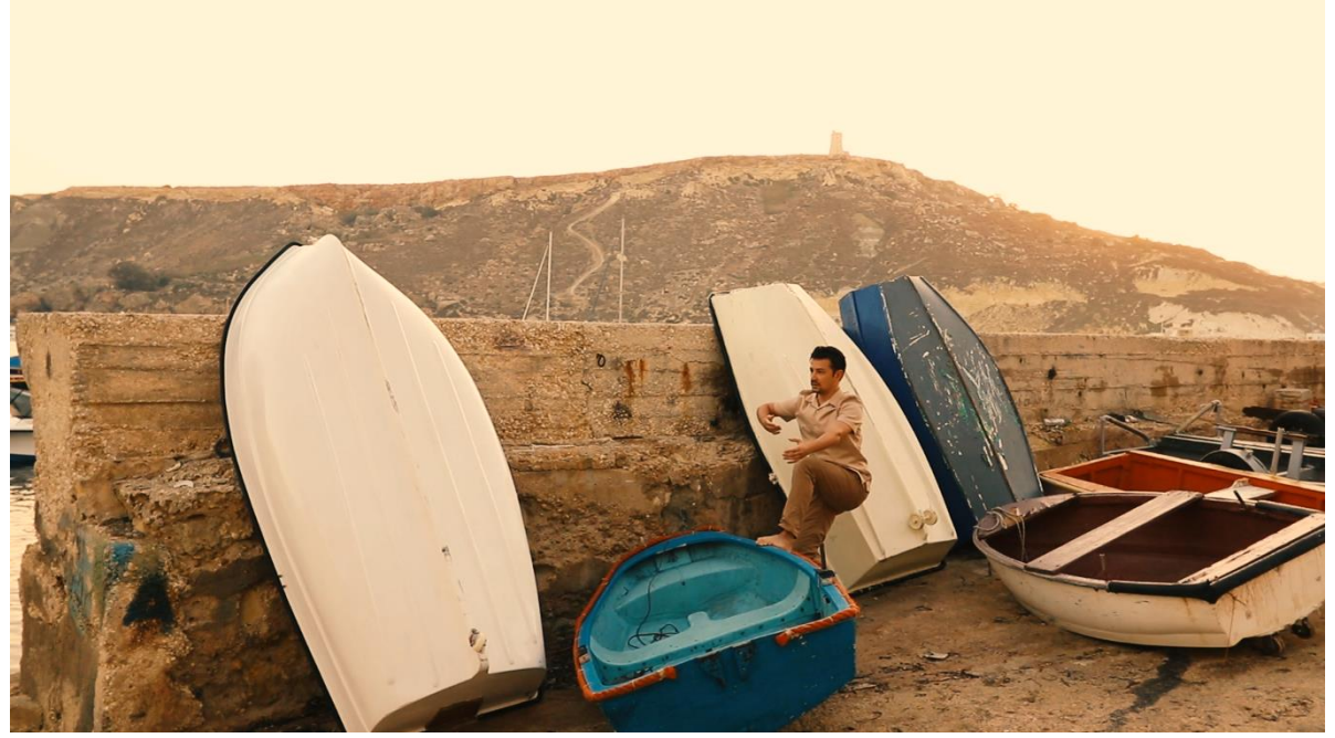
Figure 6. The beach. The dancer dialogues with empty and dismissed fishers' boats and tries to step into them even though he cannot climb over their edge. This a metaphor for all those who perished in the Mediterranean Sea, trying to escape from their home country. The Sea is history and gathers the bodies of those who did not survive from the crossing.