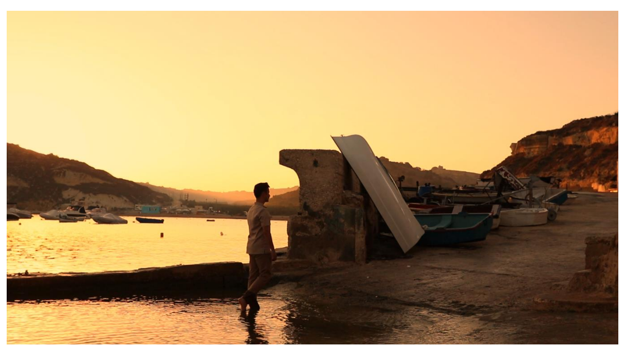
Figure 5. The beach. The performer/migrant has finally reached the shore and therefore safety. Nevertheless, nobody is there to welcome him/her. The migrant feels as a solitary body in an alien and inhospitable land that disregards him.