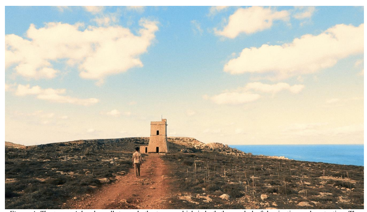
Figure 4. The tower. A lonely walk towards the tower, which is both the symbol of domination and protection. The dancer follows a straight line, giving his back to the audience and walking barefoot. He represents the migrant but also our condition as "common human beings" in the path of life.