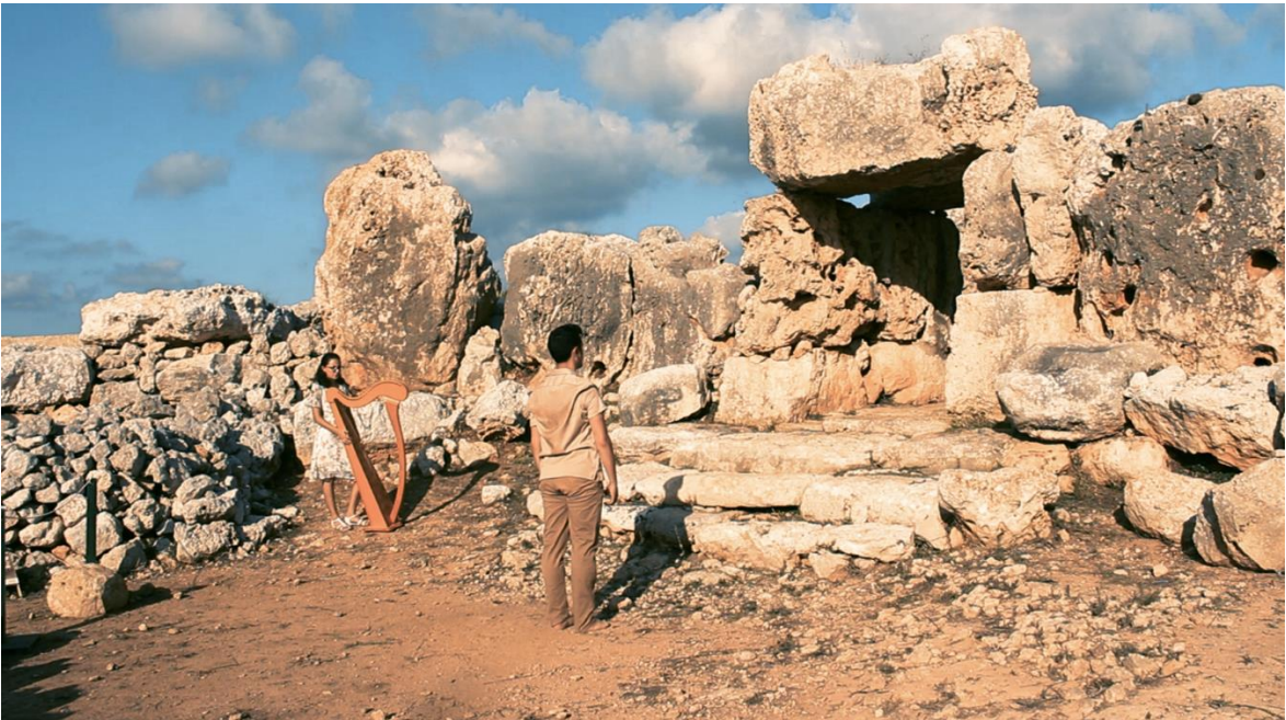
Figure 2. The temple. Towards the end of the choreography, the dancer faces the entrance of the temple as if he wanted to confront his ancestors. In this way, he reminds viewers that we are all part of the same history and heritage, and that we all came from the sea.