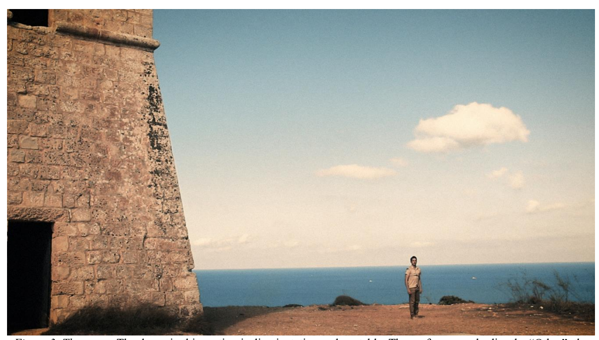
Figure 3. The tower. The dance in this section is disorientating and unstable. The performer embodies the "Other", the migrant who needs to find "roots", identity, and recognition.