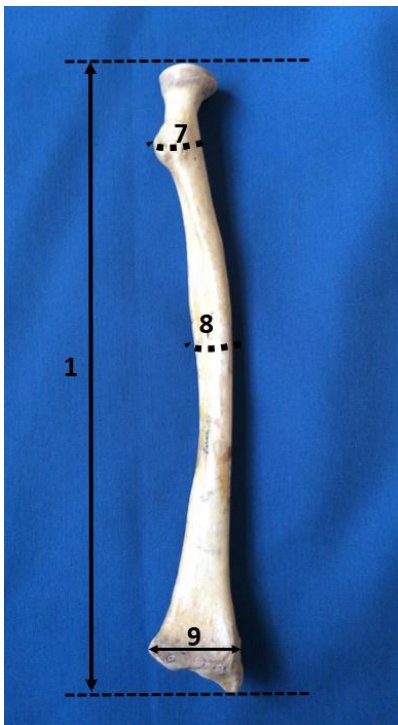
Fig. 1 Front view of radius.

Measurement variables are as follows (Figs. 1-5):