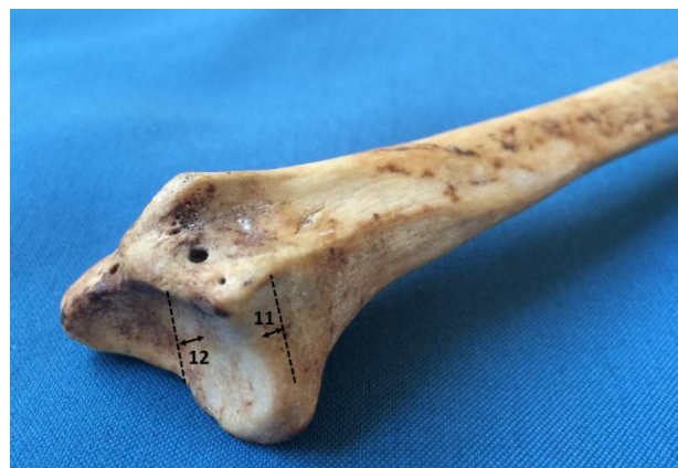
Fig. 5 Bottom-inside view of radius.