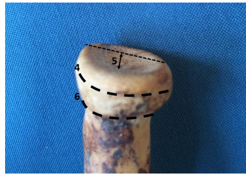
Fig. 3 Top-front view of caput radii.