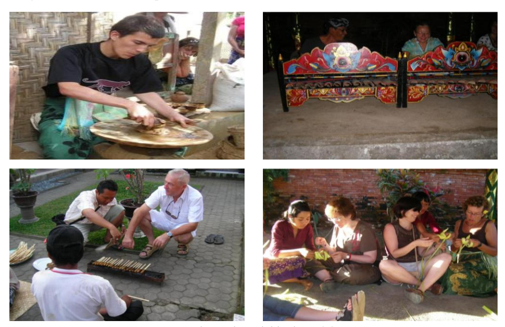
Figure 2. Tourist activities in Bedulu.

Entertainment. Entertainment attractions are displayed at dinner, with the dance performance of Studio Subadrika of Puri Bedulu. Dance shown is as follows: Panyembrama dance, Legong Kraton, Oleg Tamulilingan, Baris Dance, Joged, and Kecak (on request).