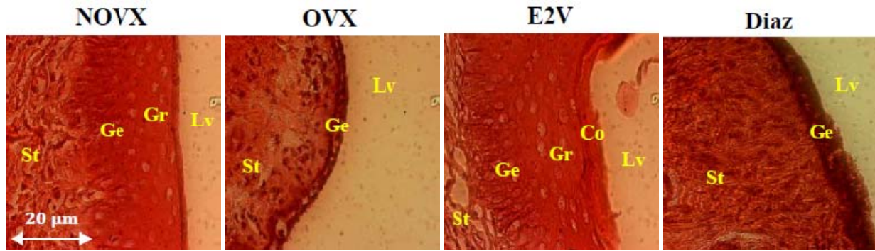
Fig. 1 Microphotographs (400 X) of the vaginal epithelium after fourteen days of estrogen depletion.

NOVX = Sham operated animals treated with the vehicle, OVX = OVX animals treated with the vehicle, E2V = OVX animals treated with estradiol valerate at 1 mg/kg BW, Diaz = OVX animals treated with diazepam 1 mg/kg BW. Lv = vaginal lumen, Co = stratum corneum, Gr = stratum granulosum, Ge = stratum germinativum, St = Stroma.