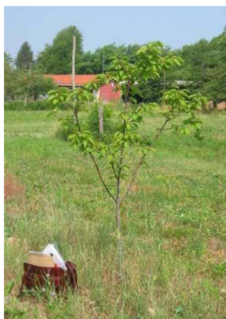
HS Somaclonal (b)