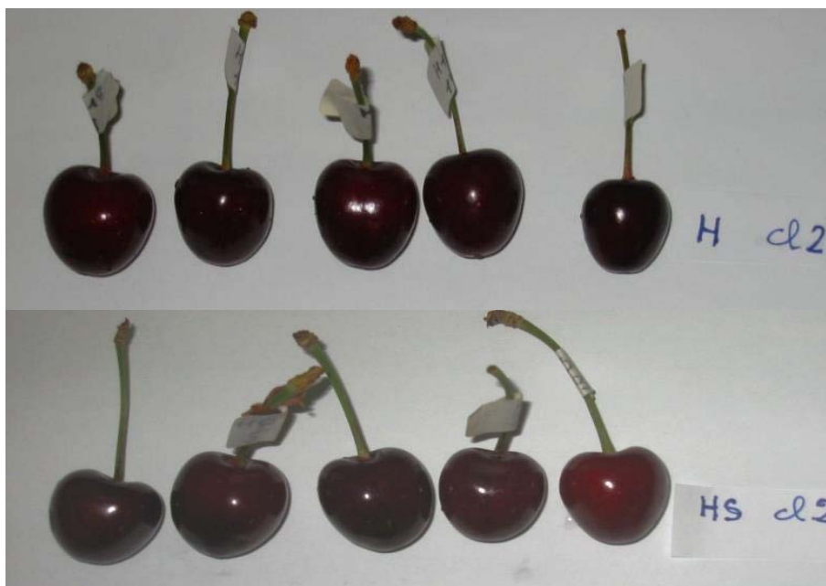
Fig. 4 Second ripeness stage of cherry fruit were collected on May 30th, 2013 (H = WT; HS = Somaclonal).