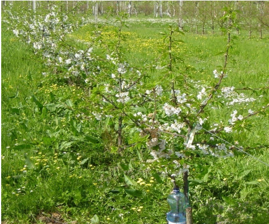
Fig. 2 WT and HS trees grafted on 'G6' blooming at second growing season.