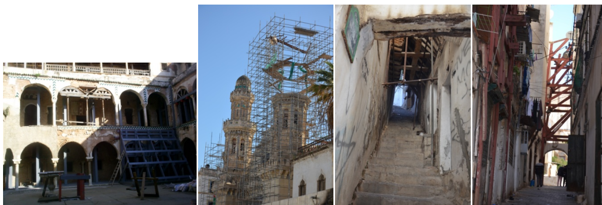
Fig. 1 From left to the right: the palace of the dey, mosque Katchaoua, Kasbah of Algiers.

The two old towns of Dellys and Ténès were created