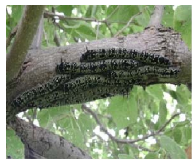
Fig. 2 Image of Cuetlas ( Arsenura armada C.) from Jonote tree ( Heliocarpus appendiculatus ).