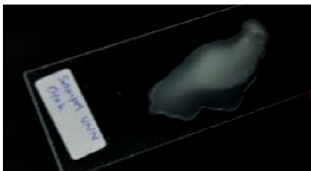
Fig. 1 Positive result in brain VNN test.

The method by using co-agglutination kit to detect viral disease in fish is done for the first time in Indonesia. The application of co-agglutination shows that the test kit produced is able to detect VNN from organ fish infected. The detection of VNN in affected brain and eye showed positive co-agglutination reaction (Figs. 1 and 2), while detection of VNN in control showed negative (Fig. 3). The agglutination reaction occurred within 5-10 min and the optimal reaction was observed within 30 min. The test result shows there is a sand on glass slide and the suspension shows the agglutination. Brain and eye specimen