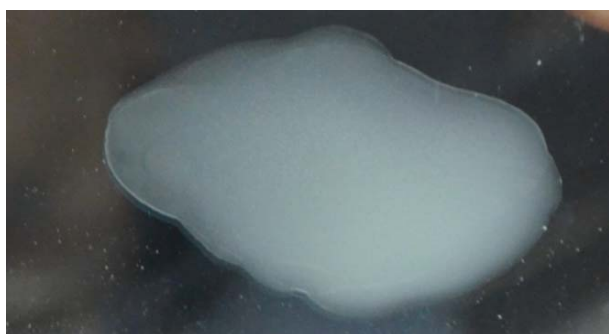
Fig. 3 Negative result in VNN test, if there is no VNN virus.

prepared from diseased fish showed positive agglutination.