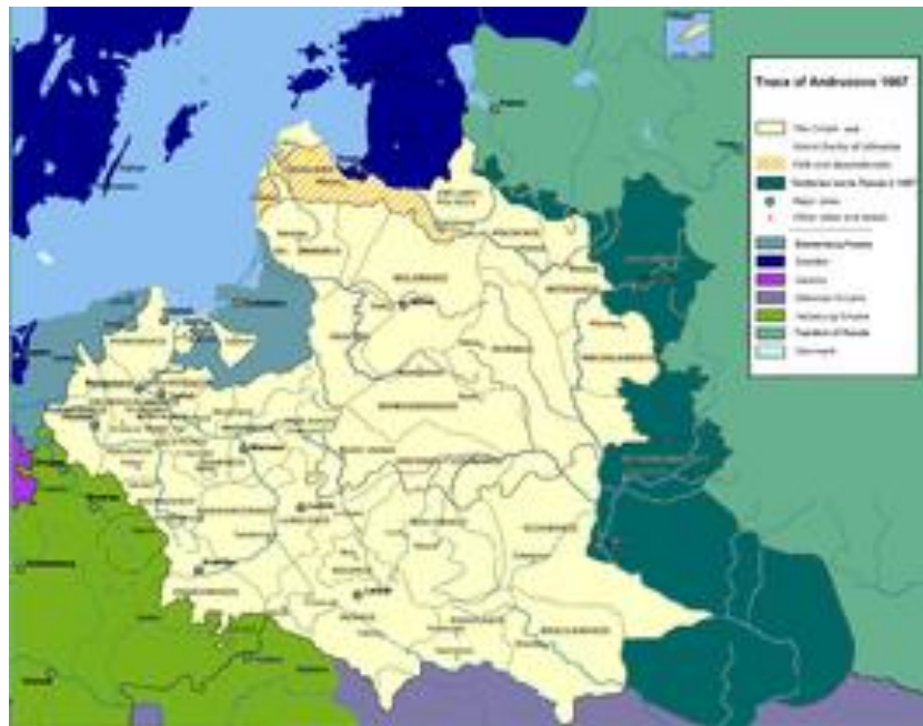
Figure 1. Ukraine Borders in 1667.

United Kingdom and United States decided to “move Poland west” on the insistence of Soviet Marshal Josef V. Stalin, initially in secret between Roosevelt and Stalin almost at the end of the Teheran conference (№ 63 memorandum) 2 on December 1, 1943, then in public at the Yalta conference, February 4, to February 11, 1945.