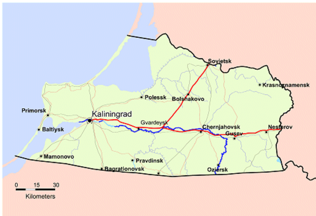
Figure 4. Kaliningrad Oblast, until 1946 Königsberg Lithuania.

Poland particularly is mobilized with troops deployed along its Eastern frontier, anticipating an imminent attack from the Russian Federation through either Belarus or Ukraine. This comes at a time when other EU countries reflect greater recalcitrance at disturbing normal relations with the Russian Federation from which they expect and rely upon continuous deliveries of natural gas supplies as winter approaches. Personal friendships are involved as well, particularly the longtime friendship between German Chancellor Angela Merkel and President Vladimir V. Putin of the Russian Federation, based on Merkel’s East German upbringing and Putin’s deployment to East Germany as a Komitet Gosudarstvennoy Bezopasnosti (KGB) officer during the Cold War period (Barkin, 2014). Strategic depth of the alliance must be augmented, not diminished, by personal relationships between and among leaders. Personal bonding of the heads of state and heads of government is valuable, provided this does not interfere with each nation’s security or the security of the alliance.