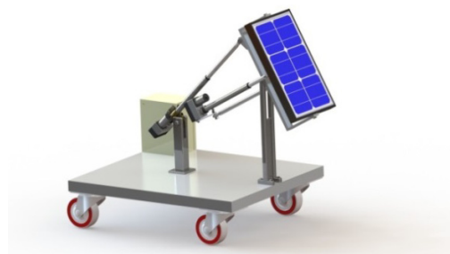
Fig. 2 The first two axes solar tracking system design.

Solar tracking systems are controlled in different ways. The most common ways to control the trackers are using PLCs, microcontrollers, PCs or relays. As the