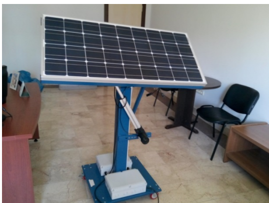
Fig. 4 Dual axis solar tracker.

Solar angle equations are given in the sun's apparent position part. To calculate these equations, it is necessary to know the time of the day. In this study, a real time clock chip, DS1302, is used to get the time of the day. In the control algorithm, the data that comes from DS1302 are taken and the date, the hour,