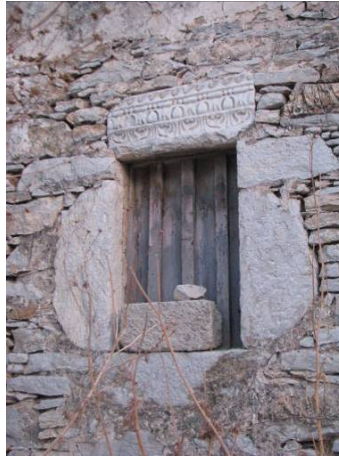
Figure 4. Use of ancient remains in construction of traditional dwellings (Cumalı and Belen, Datça).

continued to use these terraces by renovating and adapting them according to their needs in time. It can be evaluated that existence of current traditional rural settlements has also provided conservation of these archaeological evidences.