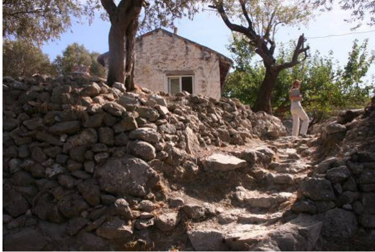
Figure 2. Traditional terraces and fruit gardens with narrow streets among rural dwellings (Söğüt, Bozburun).