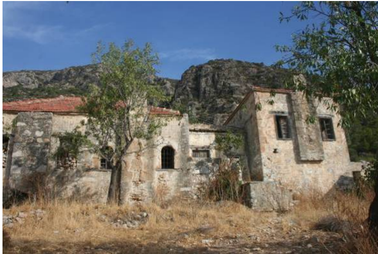
Figure 3. Example from a traditional rural architecture (Yakaköy, Datça).

When the traditional settings are examined closer, it is seen that some of them are settled close to locations of ancient settlements. In some examples, the re-use of ancient building structures during construction of houses can be still seen today (fig. 4-5). The archaeological surveys in the region show that vineyard activities in this area go back to ancient times and continue until late Roman period (Tuna, 1984,p35). There are still remains and traces of ancient agricultural terraces in the region. Diler (1994,p443) describes this type of terraces as “stepped terraces”, which were constructed with good quality of workmanship by using irregular large stone pieces with varying sizes up to 1 m width without using mortar. In relation with the topographical condition of the terrain, their length reaches up to 100 m length, while they have 3-5 m widths. Some of these terraces continued to be used recently, with slight modifications. Lateral traditional additions or alterations to these ancient terrace walls were consisted of roughly built small sized masonry constructions (Diler, 1994,p443). Similar to vicinities of Knidos, Kumyer located near Yakapınar village houses ancient agricultural terraces and rural house components. Some of these terraces have been traditionally used by villages located on them today with slight differences (Tuna, 1984:36). Therefore, following cultures after the ancient times have