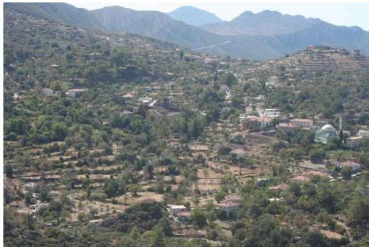
Figure 1. Traditional terraces and fruit gardens with narrow streets among rural dwellings (Söğüt, Bozburun)

Traditional rural communities of the region are the key answer to this question. The region possesses well conserved traditional villages still reflecting their traditional townscape (fig.1) and cultural landscape patterns. Use of topography in development of settlements by narrow streets donated with public structures, traditional farmhouses reflecting local architectural features, and traditional agricultural terraces, fruit gardens constructed in harmony with nature and topography form the traditional settlement and landscape patterns of rural settlements (fig. 2—3).