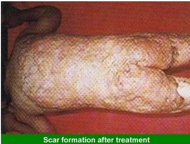
Scar formation after treatment

Fig. 26 Following-up one month later after discharged and there is apparent scar hyperplasia.