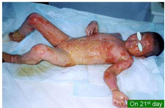
Fig. 11 The wounds condition on the 21st days (The necrotic tissues are all liquefied and cleaned).