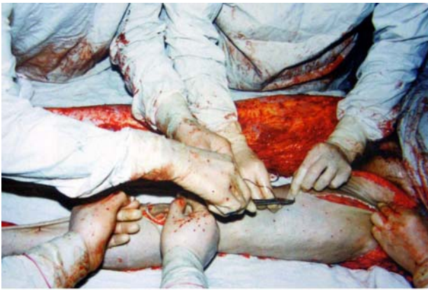
Micro-autograft combine with allograft on 4 th day.