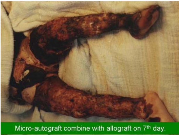
Micro-autograft combine with allograft on 7 th day.