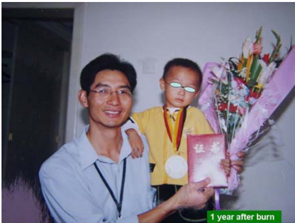
Fig. 8 Following-up after discharged from hospital 1 year later. No scar hyperplasia and disability appeared. The case received the certificate of The Fourth Burns Rehabilitation Stars.

Patient B: Female, 5 Years old. Cause of burns: Flame. Clinical diagnosis: large area and severe deep burns, TBSA = 92% (III degree burns 26%, Deep II degree burns 34%, Superficial II degree burns 32%) (Figs. 9–17).