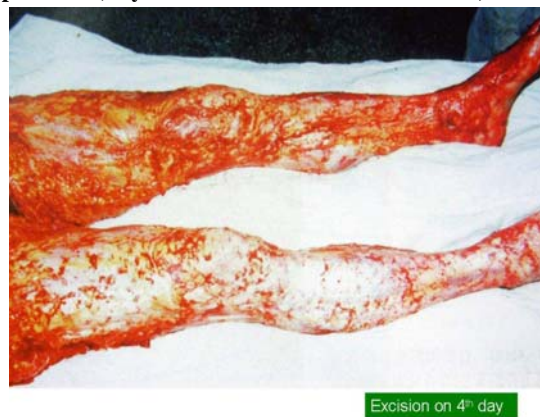
Fig. 19 4 days after hospitalized, use eschar excision on the lower limbs.