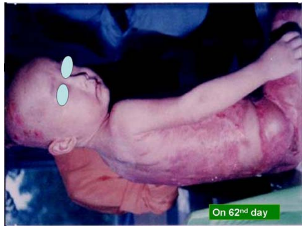
Fig. 5 The condition of wounds healing on 62nd day.