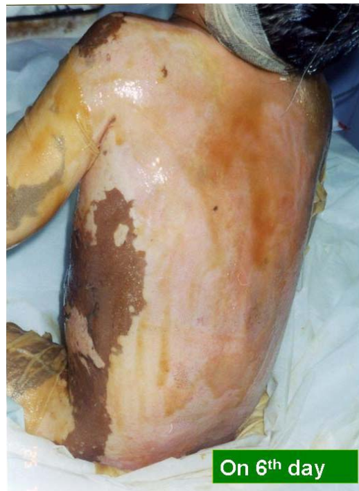
Fig. 13 The wounds condition on the back on the 6th day.