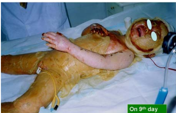
Fig. 10 The wounds condition on the 9th days (The liquefaction of the necrotic tissues continues).