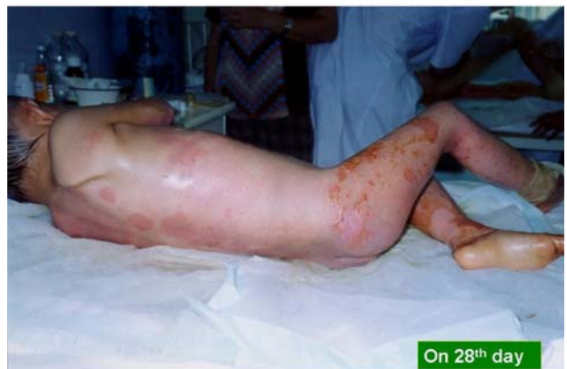
Fig. 12 The wounds condition on the 28th days (Deep II healed).