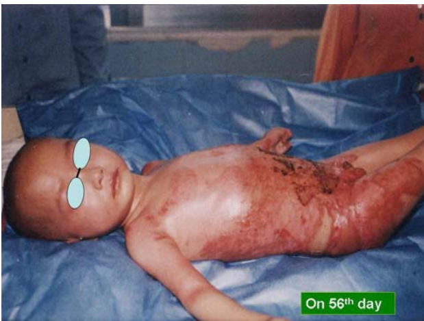
Fig. 4 The condition of wounds healing on 56th day.