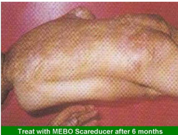
Treat with MEBO Scareducer after 6 months

Fig. 26 Following-up one month later after discharged and there is apparent scar hyperplasia.