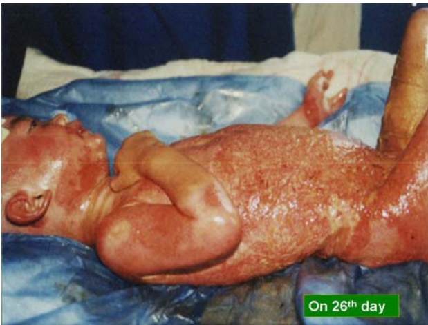
Fig. 3 Superficial III burn wounds on the chest and abdomen after 26 days' treatment.