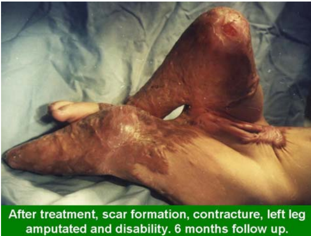
After treatment, scar formation, contracture, left leg amputated and disability. 6 months follow up.