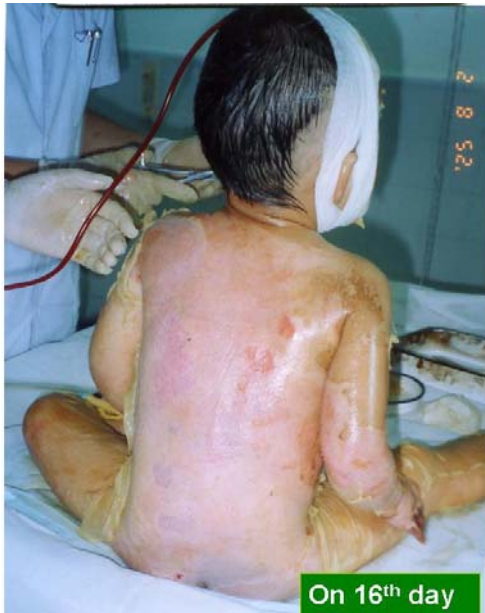
Fig. 14 The wounds condition on the back on the 16th day.