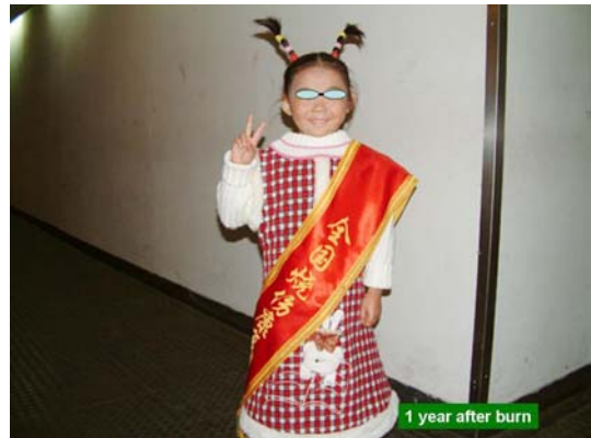
Fig. 17 Following-up after discharged from hospital 1 year later. No scar hyperplasia and disability appeared.