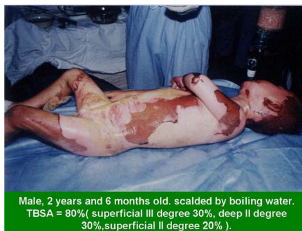
Fig. 1 The 4th days after burns (Shifted from other hospital).

Patient A: Male, 2 years and 6 months old. Cause of burns: boiled water scald. Clinical diagnosis: extensive ultra severe burns, TBSA = 80% (III degree burns 30%, Deep II degree burns 30%, Superficial II degree burns 20%). The statuses of wound healing at different periods are shown in Figs. 1–8 below.