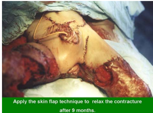
Apply the skin flap technique to relax the contracture after 9 months.