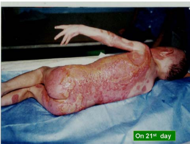
Fig. 2 The wounds on the back after 21 days' treatment (Deep II wounds healed).