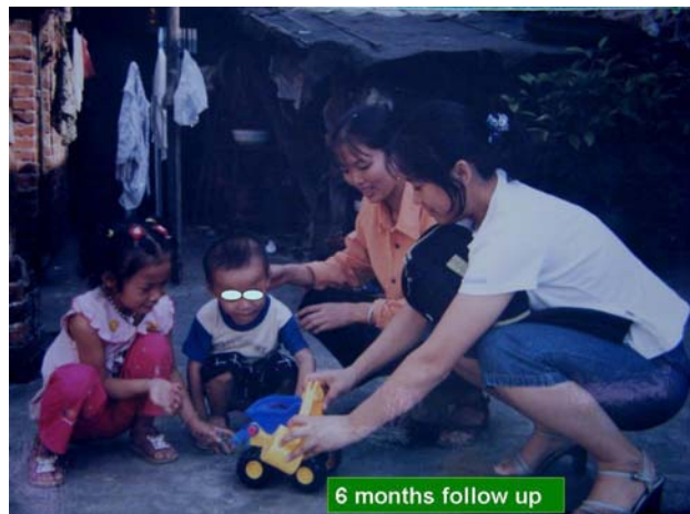
Fig. 7 Following-up after discharged from hospital 6 months later and the life of the case became normal.